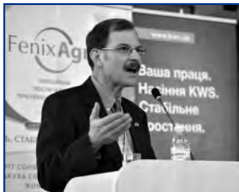
Speaking at the VII Ukrainian Dairy Congress in Kiev.

I returned home the next day due to schedule demands. However, I have received communication from them various times since returning home. In addition, I have sent them some articles that they may want to use in their dairy publication. At least two articles that have been translated and published, including one on integrity as a foundation