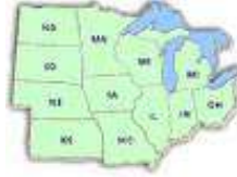
NACAA NC Region October, 2006