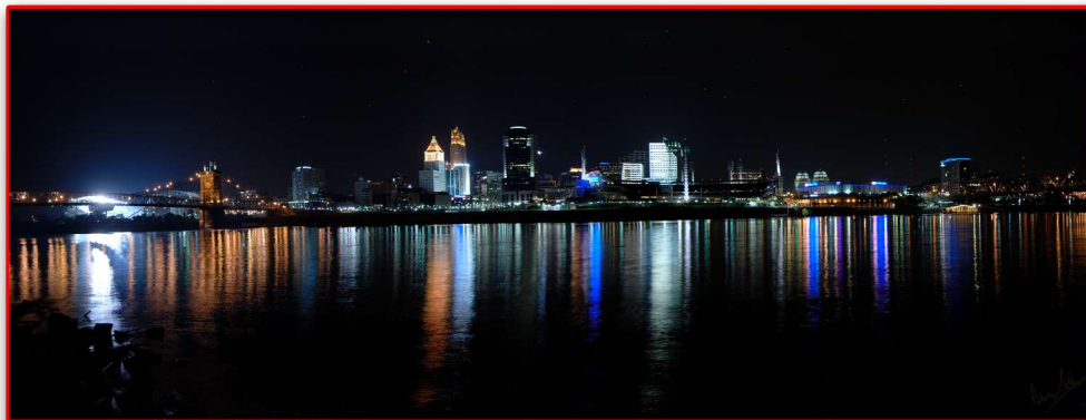
2006 NACAA AMPIC CINCINNATI - NORTHERN KENTUCKY

Simply go to the NACAA homepage and right along side the logo for the 2006 meeting is the link to AM/PIC photos. This Cincinnati skyline at night photo would make a great memento of the meeting.