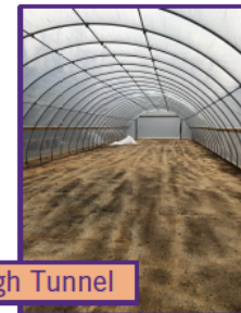
New 2019 High Tunnel