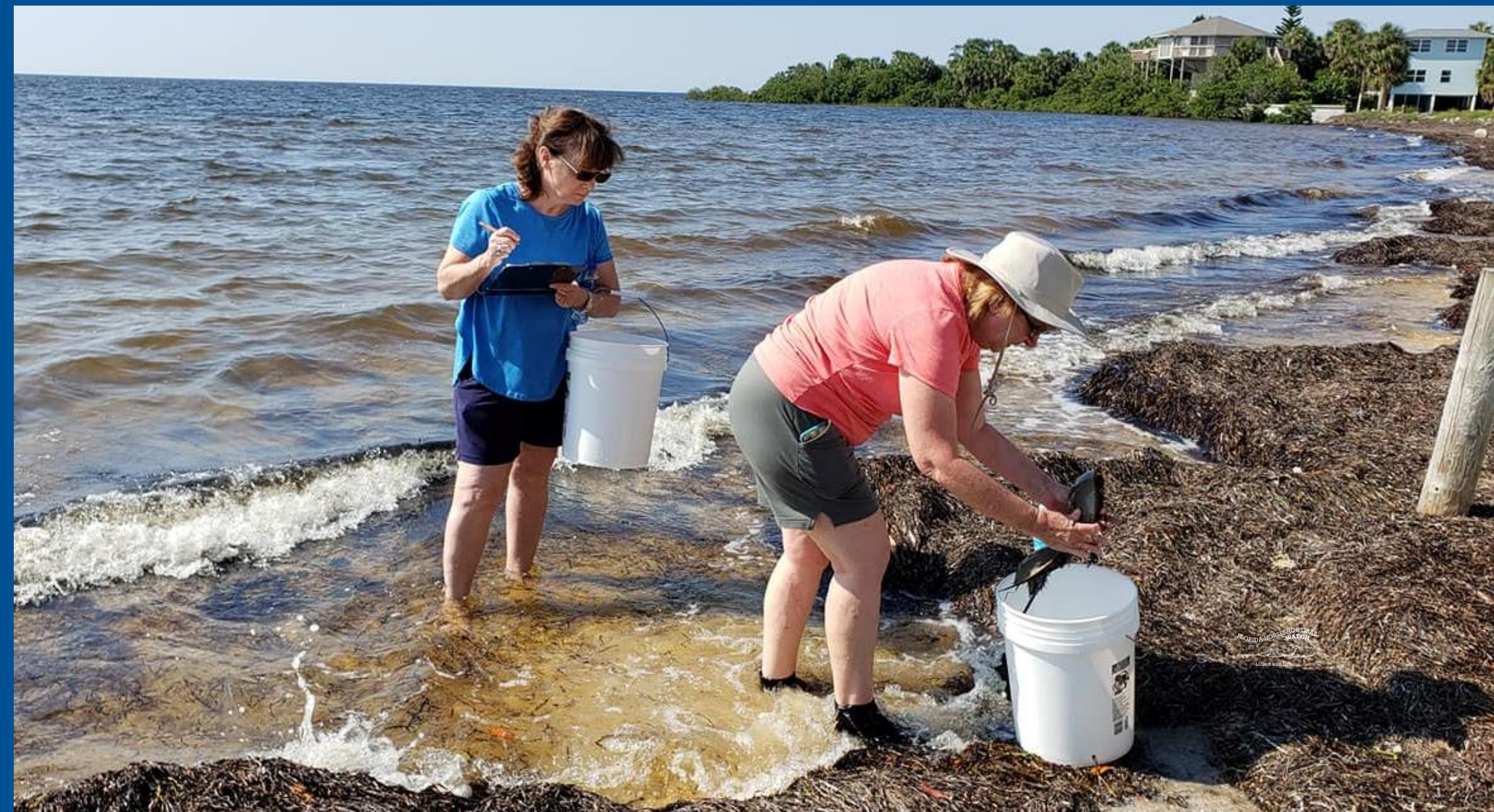
Figure 2: Volunteers survey nesting horseshoe crabs along Pine Island and collect subsamples to be tagged and released.