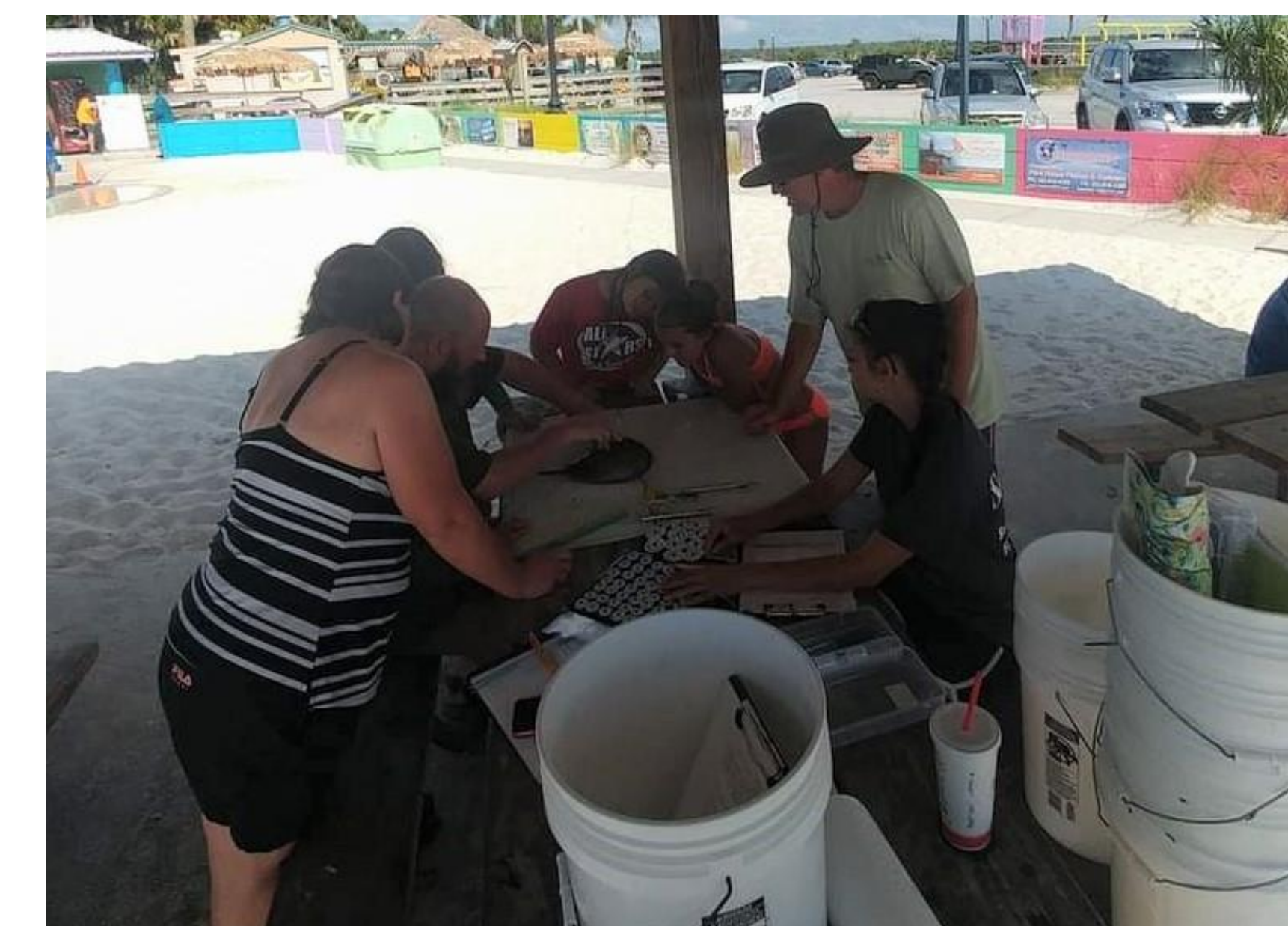
Figure 4: Agent in field teaching volunteers how to collect data on live horseshoe crabs.