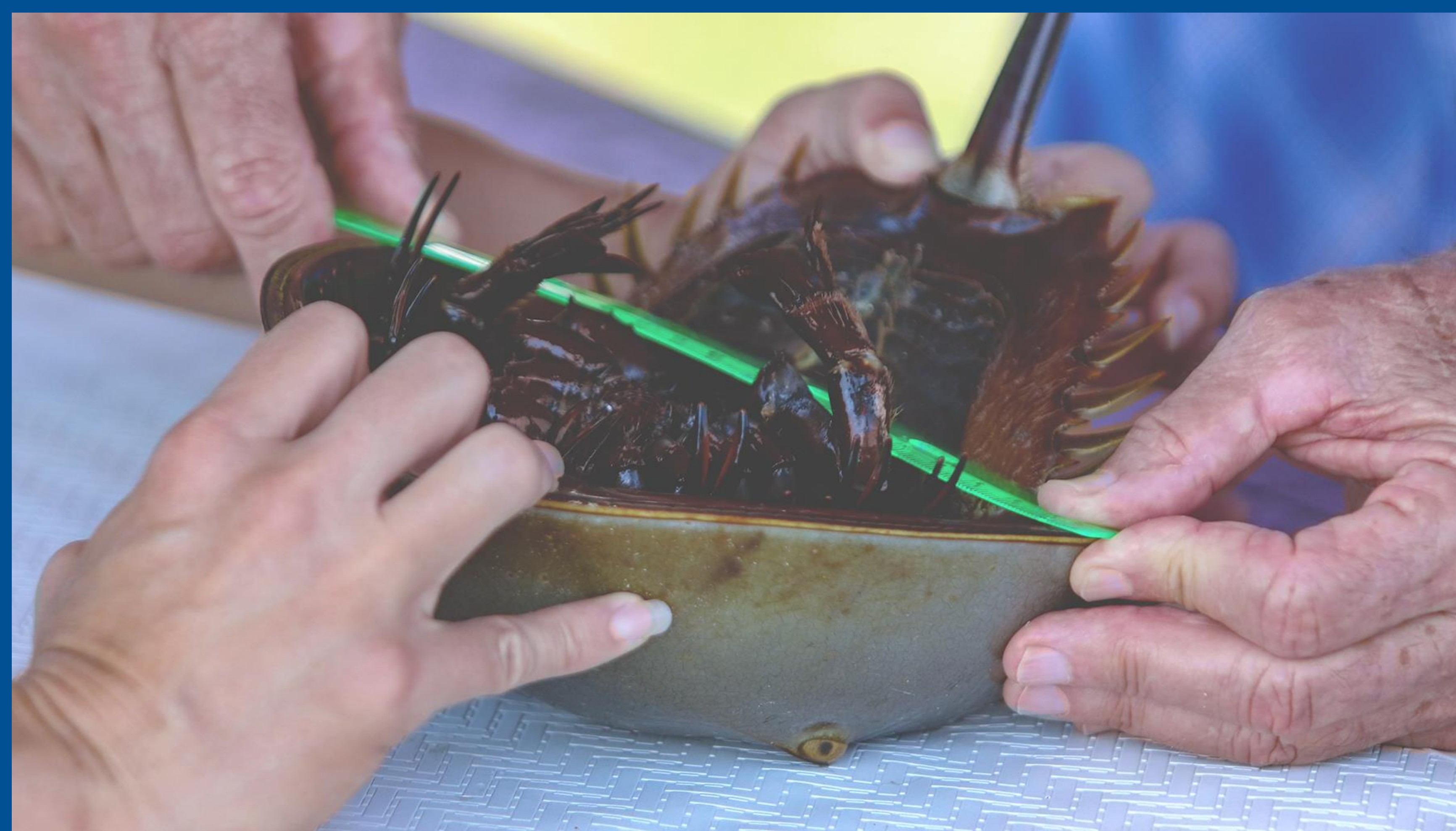
Figure 3: Volunteers measuring the carapace of a horseshoe crab collected during beach survey.