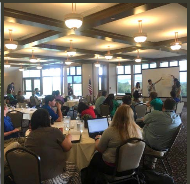
South Carolina 4-H'ers present their group's action plan with the Cornell delegation at the Establishing a CS Pathway for America's Youth training.