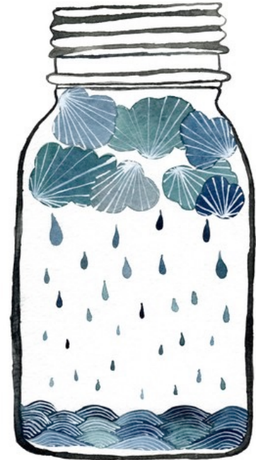
“Storm Catcher”, illustration by The Barber Shop

*Caution! This water is hot and can cause burns. Close supervision of, assistance with, or doing this step for younger youth is imperative.