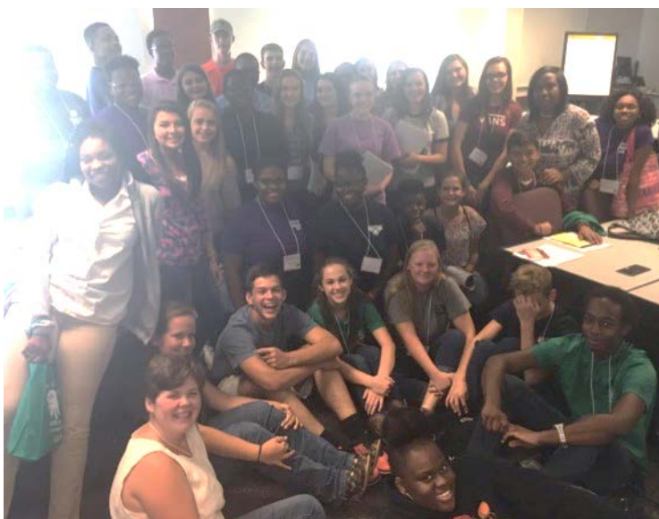
Youth participate in the SC 4-H Ambassador Training.