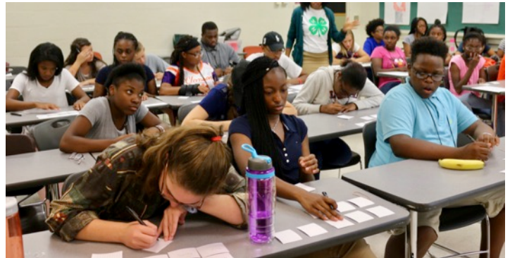
The weeklong 4-H Pinckney Leadership Conference brought 30 high school sophomores and juniors from across South Carolina to Clemson's campus to participate in numerous activities designed to promote teamwork, leadership and citizenship.