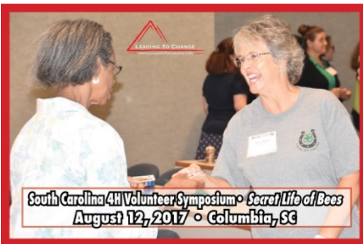
Adult volunteers participate in the 7 th annual SC 4-H Volunteer Leaders Symposium.

Ambassadors spent a good portion of the day as a group focusing on leadership and personal development. They also broke out into their specialty areas and received hands-on instructions from adult experts in their field!