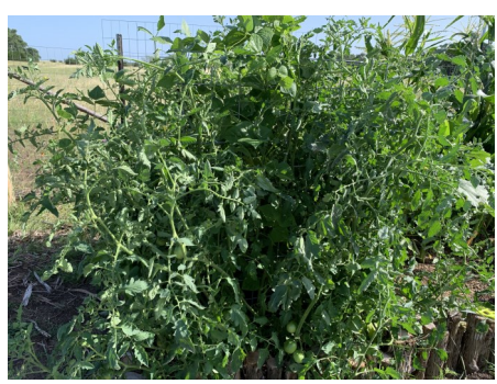
"Black Prince" tomato.

awesome tomato grower. Not counting the research varieties, the varieties "Better Bush", "Rally", "HM1823" and "Tasti-Lee", had at least 75% of the survey respondents reporting that their plants had set tomatoes. Other varieties reported set,