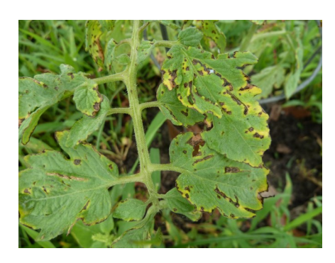
Septoria Leaf Spot

Fungal disease. Doesn't have rings, usually appears on the bottom leaves first. Prefers persistent wet and humid weather. Treat by removing foliage, mulching plants and applying a fungicide.