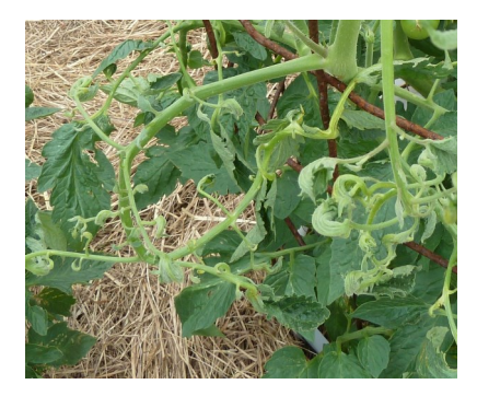
Dicamba or 2-4D damage

Tiny mites that suck the juices out of your plant. Their damage can cause speckling /sandblasted look on foliage. Worse in hot dry weather. Use a miticide or neem/ horticultural oil if the weather permits.