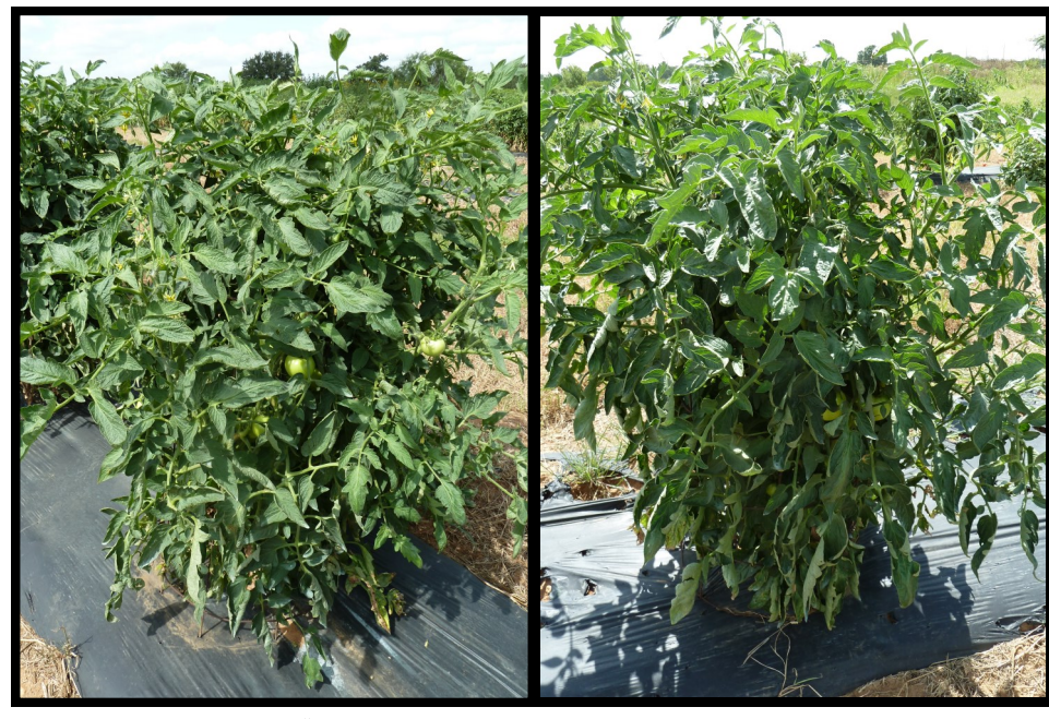
Picture on left is Grafted "Tasti-Lee" tomato plant. Picture on right is ungrafted.

Last year the Gillespie County Extension office did a tomato variety trial at one of the local farms. This year we are doing two experiments regarding tomatoes. While you can graft fruit trees, tomato plants can be grafted onto different rootstocks too. It is questionable if this is helpful, especially since grafted plants are much more expensive. The first tomato experiment will compare five grafted tomato varieties versus five un-grafted tomato varieties to see if the grafting gives these varieties an advantage in this particular area. The tomatoes were planted on April 14th, 2019 at Engel Farms.