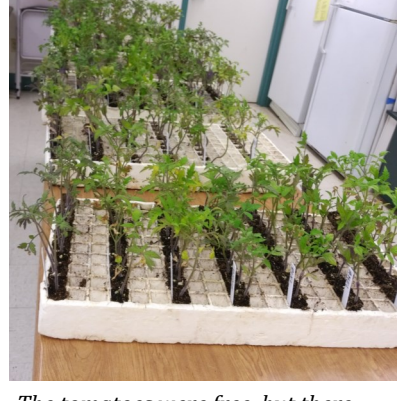
was a catch.

Field results are one thing, but would these varieties really perform that well after vou take them home? To determine the same conditions but on a more spread out and casual scale, plants from the heat stress variety trial plants were given away to homeowners to compare their results with the ones growing in the field. These results will The tomatoes were free, but there be gathered more as a survey,