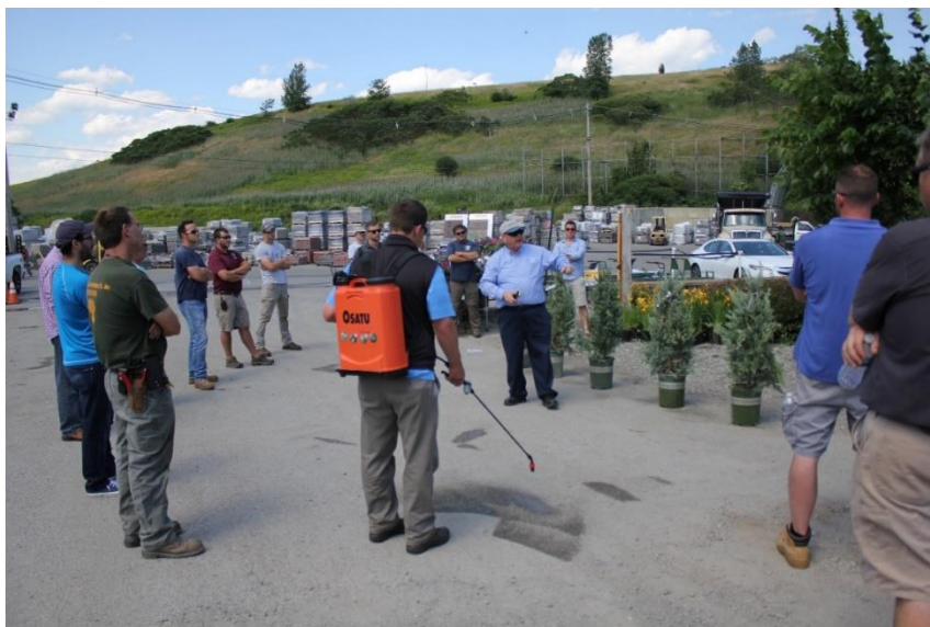
Figure 2: Discussing Coverage on Shrubs with Landscapers. 6/21/2018 Peabody, MA

Site visit work is followed up by conversations to ascertain treated area impacted by the training and calibration.