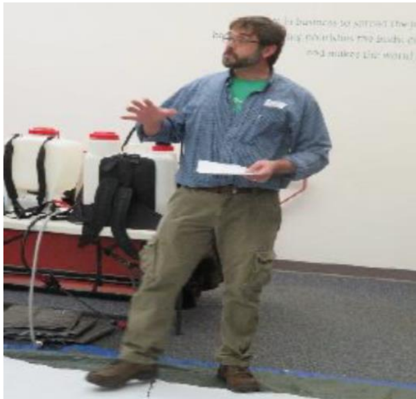
Figure 2: Discussing proper spray coverage with growers in Vermont