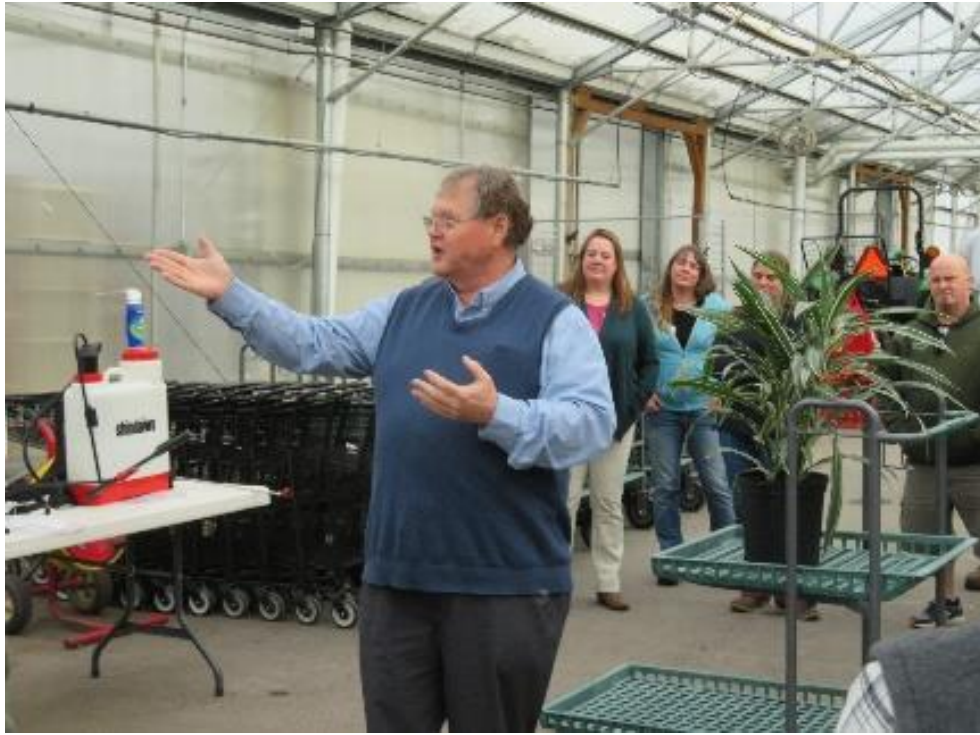
Figure 4: Discussing greenhouse sprayer calibration with growers in Maine