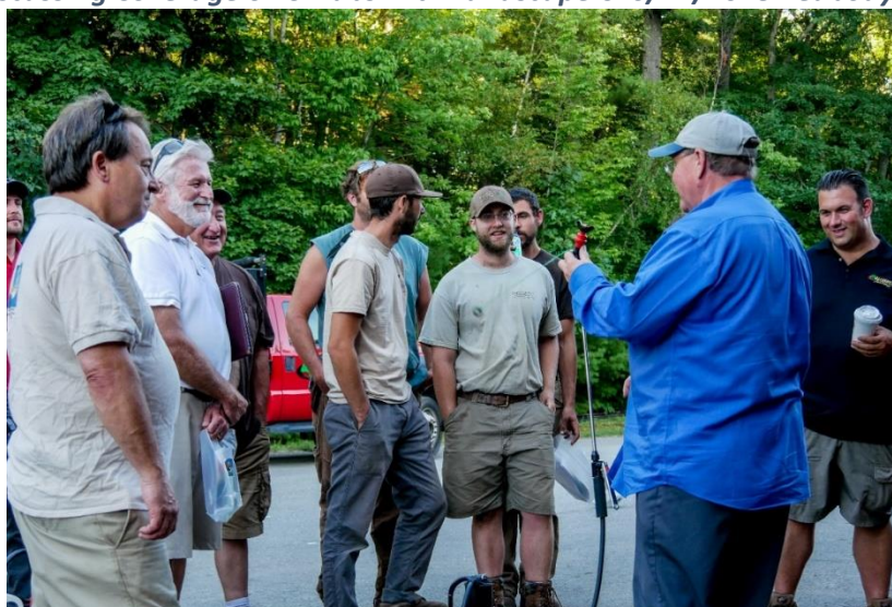
Figure 3: Discussing Control Flow Valves on a Backpack Sprayer with Landscapers. 9/19/2018 Rochester, NH