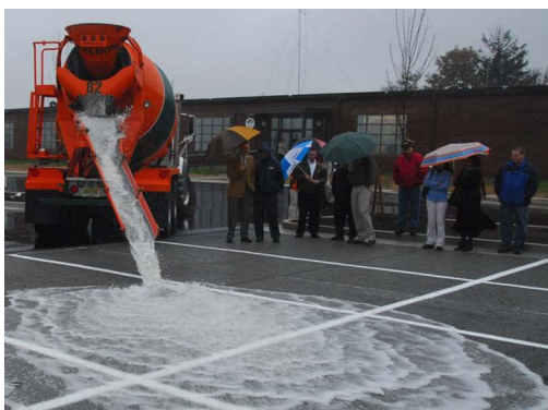
Figure 1. A cement truck discharging 2,000 gallons of water onto a permeable pavement. The water was drained from the surface in less than 4 minutes.

Permeable pavement is a stormwater drainage system that allows rainwater and runoff to move through the pavement's surface to a storage layer below, with the water eventually seeping into the underlying soil. Permeable pavement is beneficial to the environment because it can reduce stormwater volume, treat stormwater water quality, replenish the groundwater supply, and lower air temperatures on hot days.