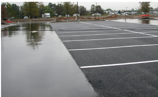
Figure 4. Traditional asphalt (left) and porous asphalt (right) during a rain event. The traditional asphalt looks wet and shiny, while the porous asphalt surface is relatively dry.

Surface cleaning should be performed using a regenerative air vacuum for cleaning the pavement, not a street sweeper. The particles and solids that get in the permeable surface need to be sucked out and removed, not just moved around the way a street sweeper would. This maintenance should be done at least twice a year: in the spring after the last snow events, and after autumn leaf fall. If the drainage rate of the pavement seems slower, vacuuming should be performed as needed. For driveways or walkways, a pressure washer can dislodge particles in permeable asphalts and concretes. The jet must be angled very low to push the particles up and out rather than straight down, which would push the solids deeper into the material.