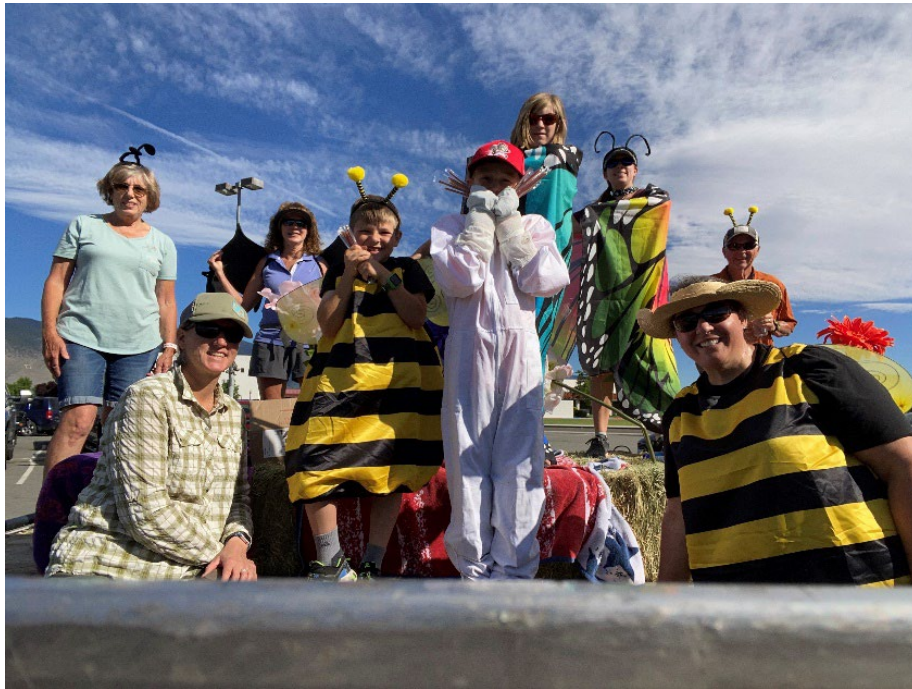
Figure 3: Our float theme was pollinators and we handed out honey sticks along the parade route.