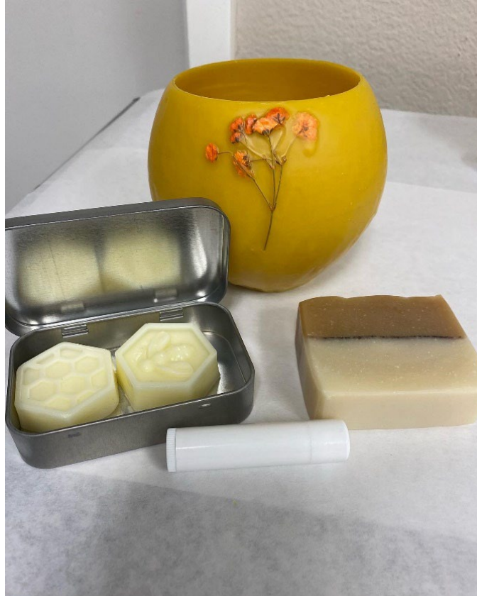
Figure 4: Products from the hive class included lotion bars (in the tin), a beeswax luminary, soap, and lip balm.

Regarding the focused social media efforts during June 1-30, our Extension Facebook page (@UNRExtensionDouglas) reach was 1,520, up 38.7%; page visits were 110, up 254.8%; and there were 14 new page likes, up 75%. Posts, specifically the daily feature of a pollinator-friendly plant, were scheduled in advance to make it as easy as possible to have a consistent presence.