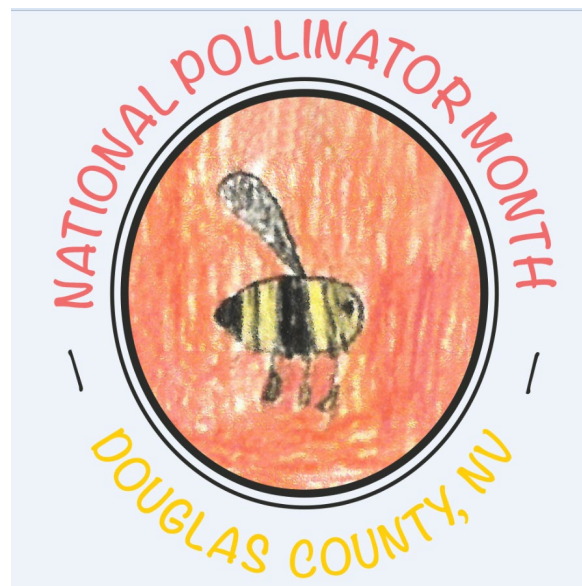
Figure 1: The winning logo (orange bee) was chosen by the most votes by the planning committee. It was slightly digitally altered to be printed on t-shirts.

The planning for a month-long celebration of pollinators began two months before the event. This was a completely new event and targeted education and outreach. Additionally, we hosted a logo contest before the event and had four youths submit logo ideas. The top two were used on promotional items including marketing materials, clothing items, and postcards.