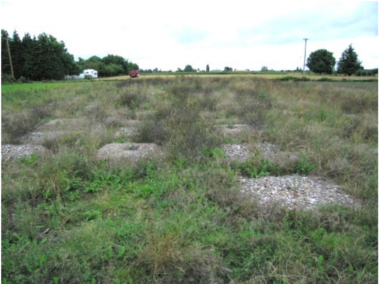
Figure 9. One year after mulch installation, weeds have covered the area except where wood chips are the deepest (8-12 inches).