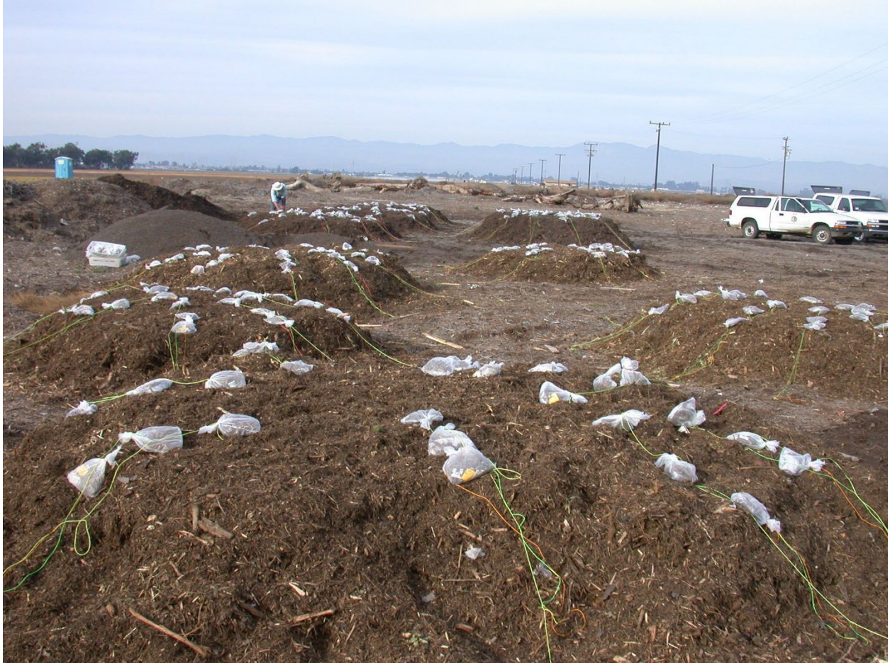
Figure 6. Research on buried inoculum studies shows that pathogens are poor survivors in fresh wood chip mulches or yard wastes.

Unfortunately, the concurrence of “mulch volcanoes” with dead and dying trees has led many homeowners as well as professionals to assume a causal relationship: in other words, mulch volcanos are causing tree death. While it’s true that poorly chosen mulches as discussed earlier can create low oxygen conditions that are conducive to disease, AWC do not do this. In fact, research has demonstrated that tree trunks deliberately wounded and then covered with AWC do as well, if not better, than those wounded trees left uncovered (Giblin, 2021; Figure 7). There has been no research to show any linkage between deep layers of AWC and plant damage.