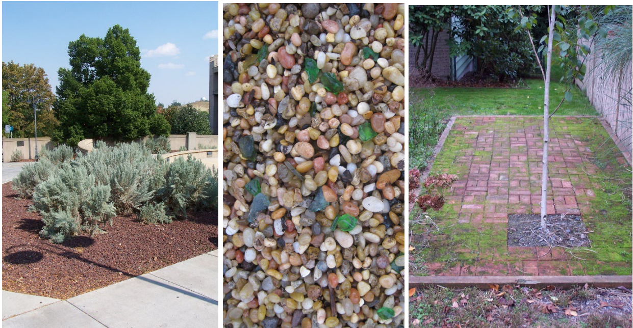
Figure 3. Examples of different inorganic mulch materials.

heat the underlying soil and they do provide several benefits. While deep layers of stone mulch will initially prevent weed establishment, this is not a permanent benefit as seeds and soil blow in and settle among the stones, leading to weed populations that can be very difficult to control without herbicide use.