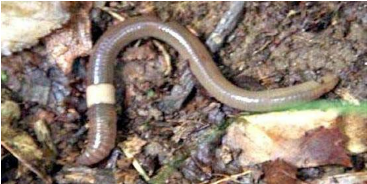
Figure 11. Amyntas species are easy to distinguish from other earthworms, but the diets of all worms are similar.

One of the newest (and most puzzling) myths we’ve come across is that jumping worms ( Amyntas spp.), introduced from Asia, eat wood chip mulches (e.g., Gupta, 2021) and can be transported in freshly cut arborist wood chips. Regardless of where worms come from, they share the same general physiology and morphology. Worms do not have teeth, nor can they ingest large pieces of wood. Jumping worms (Figure 11), like any other worms, feed on small particles of decomposed organic material. Their presence in newly produced AWC (which is anecdotal at best) is a correlative phenomenon that should not be elevated to a causal one.