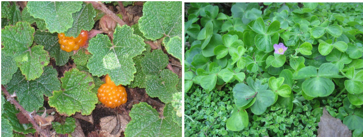
Figure 1. Examples of a sun-tolerant (left) and shade tolerant (right) groundcover, also known as living mulch.

Homeowners are most familiar with lawns, but mosses and many short-statured flowering plants (e.g., Dymondia margaretae [silver carpet]) can serve as functional and attractive living mulches. While groundcovers provide many of the benefits associated with mulches, they do compete with other landscape plants for water, nutrients, sunlight, and space. Where any of these resources are limited – especially water – nonliving mulches are a better choice.