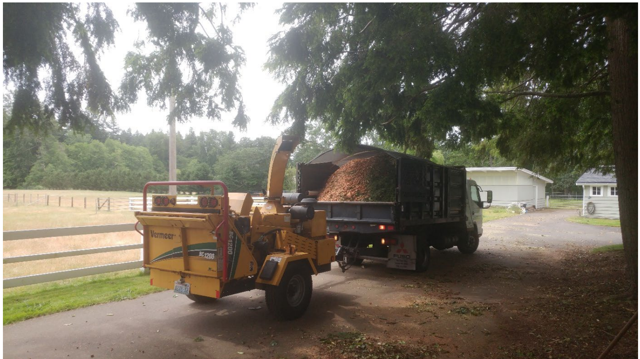
Figure 4. Arborist wood chips delivery from a local tree service.

Arborist wood chips are available from tree services, where tree prunings and removals are immediately fed through the chipper (Figure 4). Unfortunately, homeowners and professionals are often reluctant to use AWC mulches because of perceived drawbacks, none of which are supported by research. We deconstruct five misconceptions below.