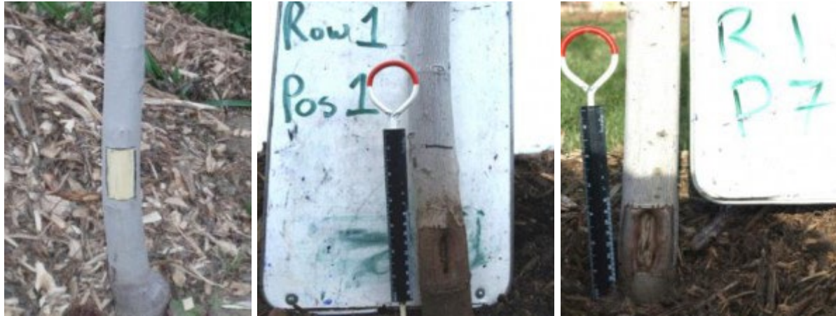
Figure 7. Wounded maple trees (left) were covered with AWC mulch (center) or left exposed (right). Wound closure was generally enhanced when covered with arborist wood chips.