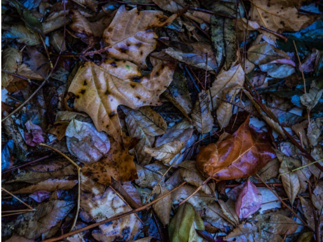
Figure 5. Thick, matted layers of decomposing leaves will restrict air flow between the soil and the atmosphere.

Arborist wood chips, on the other hand, cannot form impermeable mats and their use as a mulch has never been associated with plant injury or death. As discussed in our earlier article (Chalker-Scott and Downer, 2018), AWC are not carriers of pathogens and will not cause disease (Figure 6), even if they are made from diseased trees. Instead, they serve as habitat and a carbon or food source for myriad beneficial fauna and microbial flora (Stefani et al., 2022). Beneficial microbes can cover mulch particles and root and trunk surfaces, making them less likely to be colonized by pathogenic species.