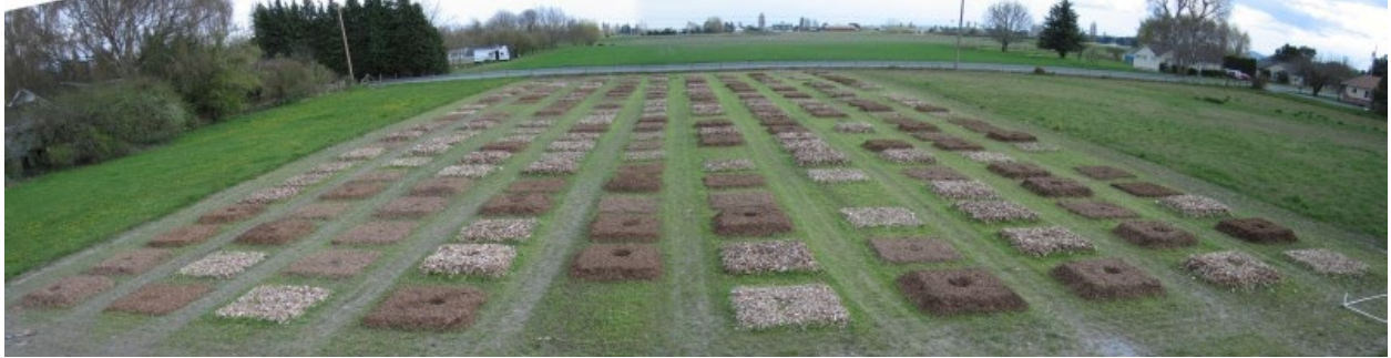
Figure 8. Freshly installed wood chip mulches at different depths during field research.