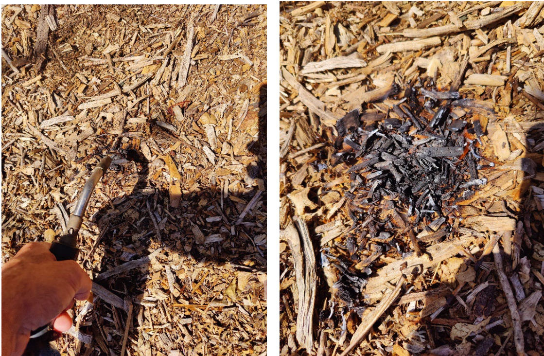
Figure 10. Contrary to popular belief, AWC do not easily burn even when subjected to direct flames. Charring is the only result.

While public fire agencies often advise against wood chip mulches, there is little research-based evidence to support this caution and good evidence to suggest they are relatively inflammable. Since AWC can absorb and hold moisture in irrigated landscapes, their flammability is greatly reduced. AWC are also rapidly invaded and decomposed by fungi, which are mostly composed of water and are not in themselves flammable. Composted wood chips will be well-inoculated with fungi as a function of the composting process, as will fresh AWC soon after their application to the soil. Quarles and Smith (2011) found that mulch materials varied in their flammability: western red cedar bark chips were the most flammable, while composted mixed wood chips only smoldered when tested (Figure 10). Likewise, conifer chips are generally more flammable than hardwood chips (Ganteaume et al., 2009). Flammability could be attributed to the waxes found in bark, and this is a good reason to avoid bark mulches.