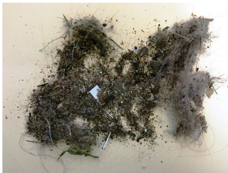
Figure 2. Typical example of sample submitted by presumed DI client. Contents include pet hair, human hair, dirt, plant material, paper scraps, beads, popcorn kernel, sunflower seed, pet toenails and feathers.