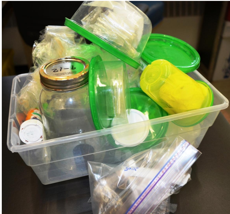
Figure 1. The specimen sign: example of “sample” over-submission by presumed DI client.

A typical DI sufferer will bring many containers of “samples” on their first or subsequent visits seeking help (Figure 1). These samples may contain skin scrapings, floor sweepings (Figure 2), lint, paper, clothing, bedding, or used bath water (Fellner & Majeed, 2009; Lee, 2008; Lyell, 1983). This action is such a common characteristic of the condition that Freudenmann & Lepping (2009) call it “the specimen sign.”