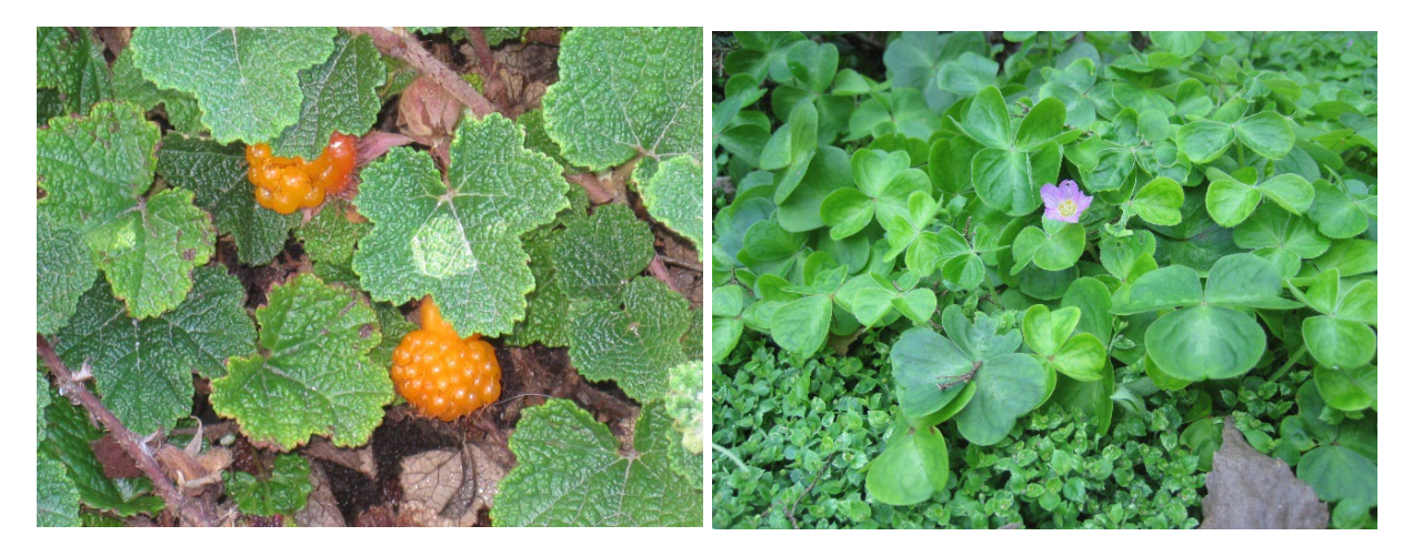
Figure 1. Examples of a sun-tolerant (left) and shade tolerant (right) groundcover, also known as living mulch.

Living mulches are simply groundcovers (Figure 1). These include cover crops (commonly used in sustainable agriculture) and ornamental groundcovers. Homeowners are most familiar with lawns, but mosses and many short-statured flowering plants (e.g., Dymondia margaretae [silver carpet]) can serve as functional and attractive living mulches. While groundcovers provide many of the benefits associated with mulches, they do compete with other landscape plants for water, nutrients, sunlight, and space. Where any of these resources are limited – especially water – nonliving mulches are a better choice.