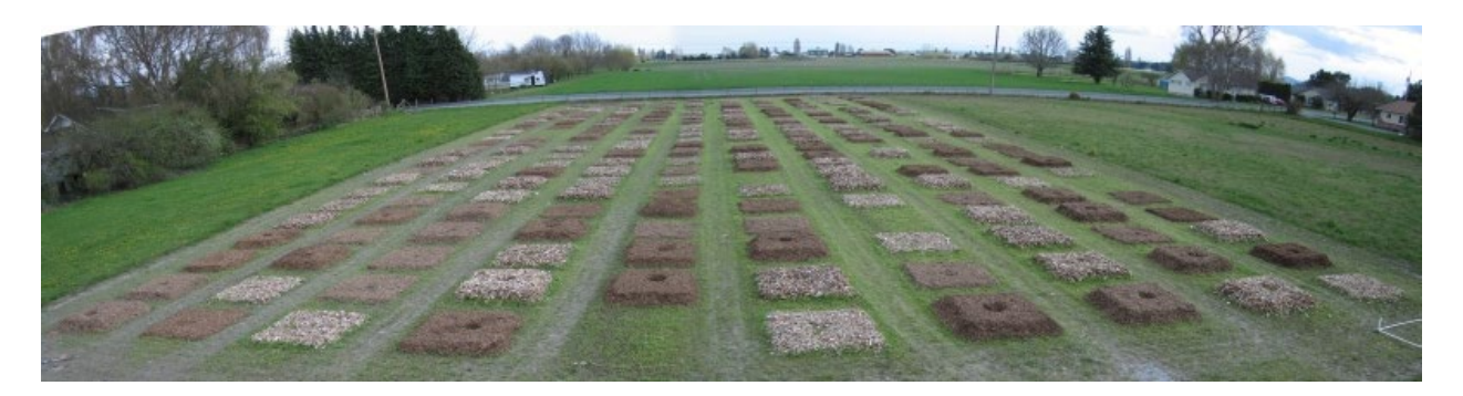
Figure 8. Freshly installed wood chip mulches at different depths during field research.