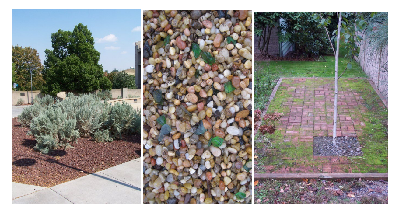
Figure 3. Examples of different inorganic mulch materials.

heat the underlying soil and they do provide several benefits. While deep layers of stone mulch will initially prevent weed establishment, this is not a permanent benefit as seeds and soil blow in and settle among the stones, leading to weed populations that can be very difficult to control without herbicide use.