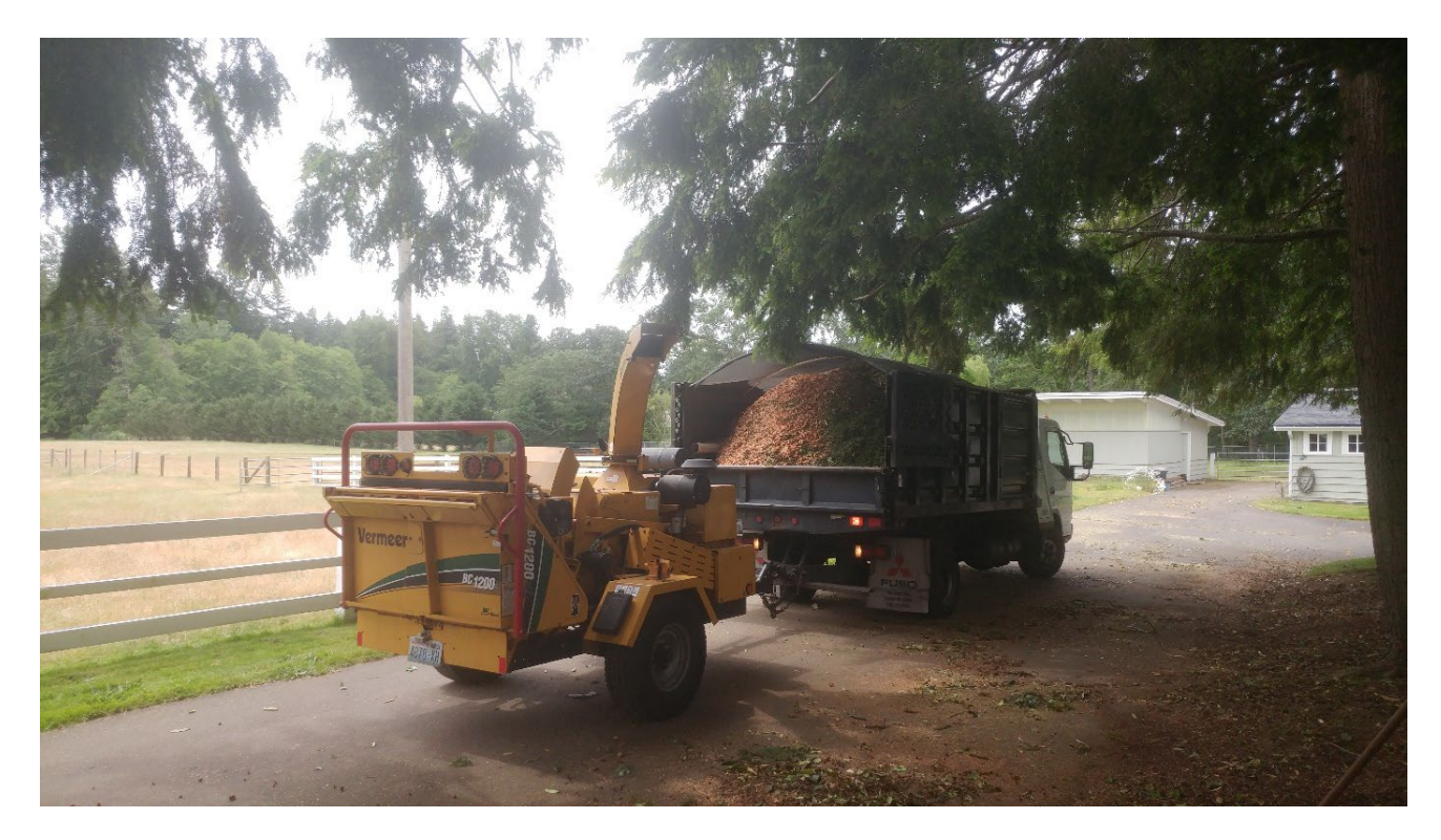
Figure 4. Arborist wood chips delivery from a local tree service.

There are wood chip mulches (e.g., hog fuel and playground chips) available at garden centers and other retail sites. But the landscape plant and soil research to date overwhelmingly suggest that arborist wood chip (AWC) mulches provide more benefits and fewer drawbacks than any of the other mulch choices (Chalker-Scott, 2007). Arborist wood chips are available from tree services, where tree prunings and removals are immediately fed through the chipper (Figure 4). Unfortunately, homeowners and professionals are often reluctant to use AWC mulches because of perceived drawbacks, none of which are supported by research. We deconstruct five misconceptions below.