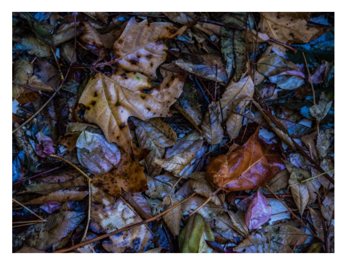
Figure 5. Thick, matted layers of decomposing leaves will restrict air flow between the soil and the atmosphere.

Arborist wood chips, on the other hand, cannot form impermeable mats and their use as a mulch has never been associated with plant injury or death. As discussed in our earlier article (Chalker-Scott and Downer, 2018), AWC are not carriers of pathogens and will not cause disease (Figure 6), even if they are made from diseased trees. Instead, they serve as habitat and a carbon or food source for myriad beneficial fauna and microbial flora (Stefani et al., 2022). Beneficial microbes can cover mulch particles and root and trunk surfaces, making them less likely to be colonized by pathogenic species.