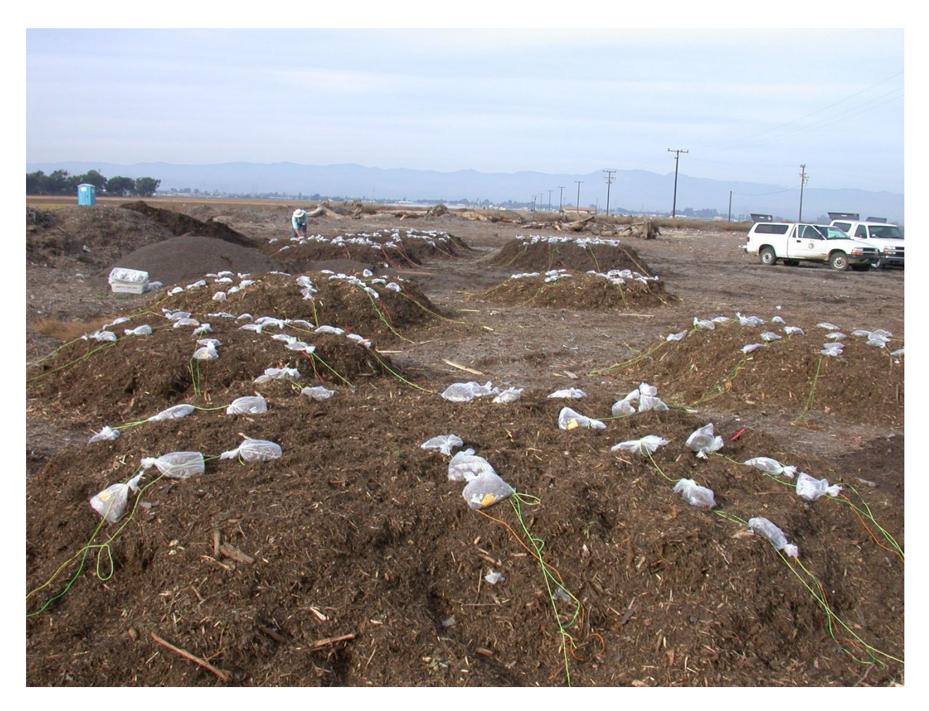
Figure 6. Research on buried inoculum studies shows that pathogens are poor survivors in fresh wood chip mulches or yard wastes.

Unfortunately, the concurrence of "mulch volcanoes" with dead and dying trees has led many homeowners as well as professionals to assume a causal relationship: in other words, mulch volcanos are causing tree death. While it's true that poorly chosen mulches as discussed earlier can create low oxygen conditions that are conducive to disease, AWC do not do this. In fact, research has demonstrated that tree trunks deliberately wounded and then covered with AWC do as well, if not better, than those wounded trees left uncovered (Giblin, 2021; Figure 7). There has been no research to show any linkage between deep layers of AWC and plant damage.