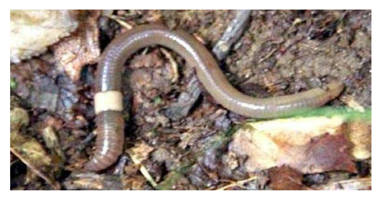
Figure 11. Amynthas species are easy to distinguish from other earthworms, but the diets of all worms are similar.

One of the newest (and most puzzling) myths we've come across is that jumping worms ( Amynthas spp.), introduced from Asia, eat wood chip mulches (e.g., Gupta, 2021) and can be transported in freshly cut arborist wood chips. Regardless of where worms come from, they share the same general physiology and morphology. Worms do not have teeth, nor can they ingest large pieces of wood. Jumping worms (Figure 11), like any other worms, feed on small particles of decomposed organic material. Their presence in newly produced AWC (which is anecdotal at best) is a correlative phenomenon that should not be elevated to a causal one.