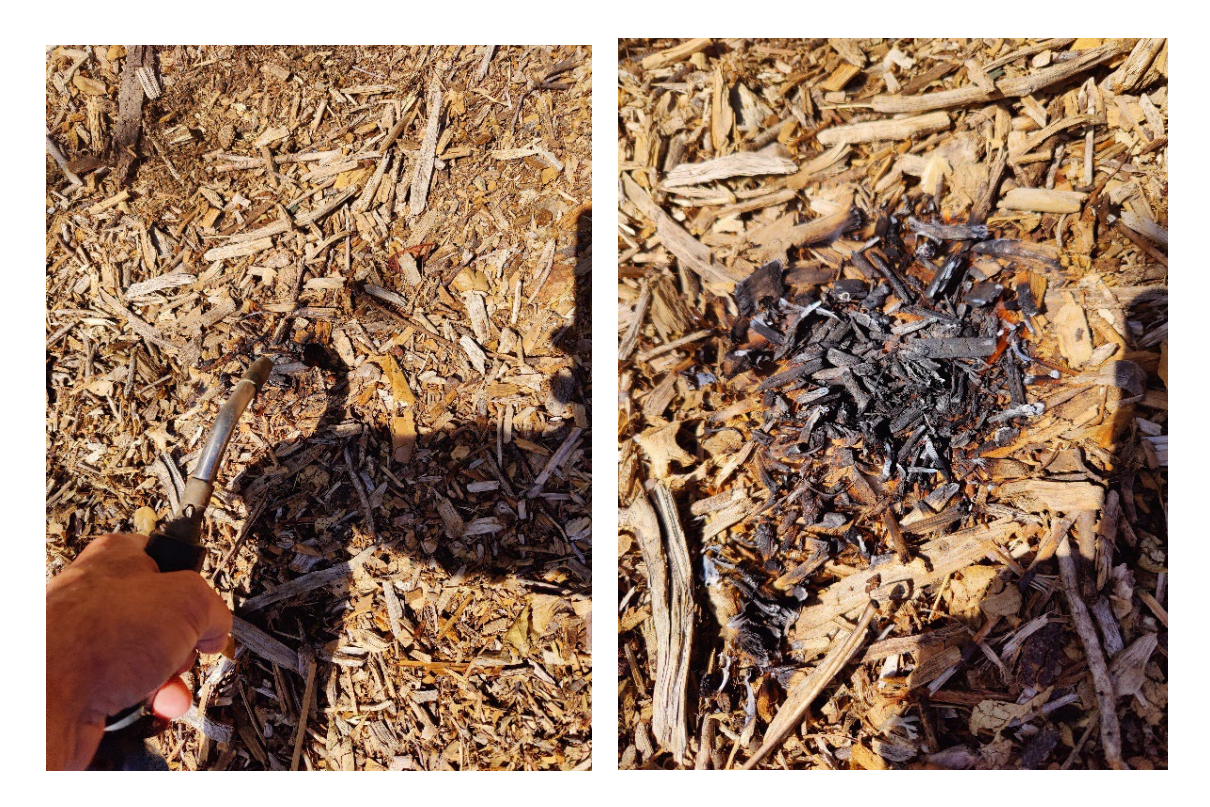
Figure 10. Contrary to popular belief, AWC do not easily burn even when subjected to direct flames. Charring is the only result.

While public fire agencies often advise against wood chip mulches, there is little research-based evidence to support this caution and good evidence to suggest they are relatively inflammable. Since AWC can absorb and hold moisture in irrigated landscapes, their flammability is greatly reduced. AWC are also rapidly invaded and decomposed by fungi, which are mostly composed of water and are not in themselves flammable. Composted wood chips will be well-inoculated with fungi as a function of the composting process, as will fresh AWC soon after their application to the soil. Quarles and Smith (2011) found that mulch materials varied in their flammability: western red cedar bark chips were the most flammable, while composted mixed wood chips only smoldered when tested (Figure 10). Likewise, conifer chips are generally more flammable than hardwood chips (Ganteaume et al., 2009). Flammability could be attributed to the waxes found in bark, and this is a good reason to avoid bark mulches.