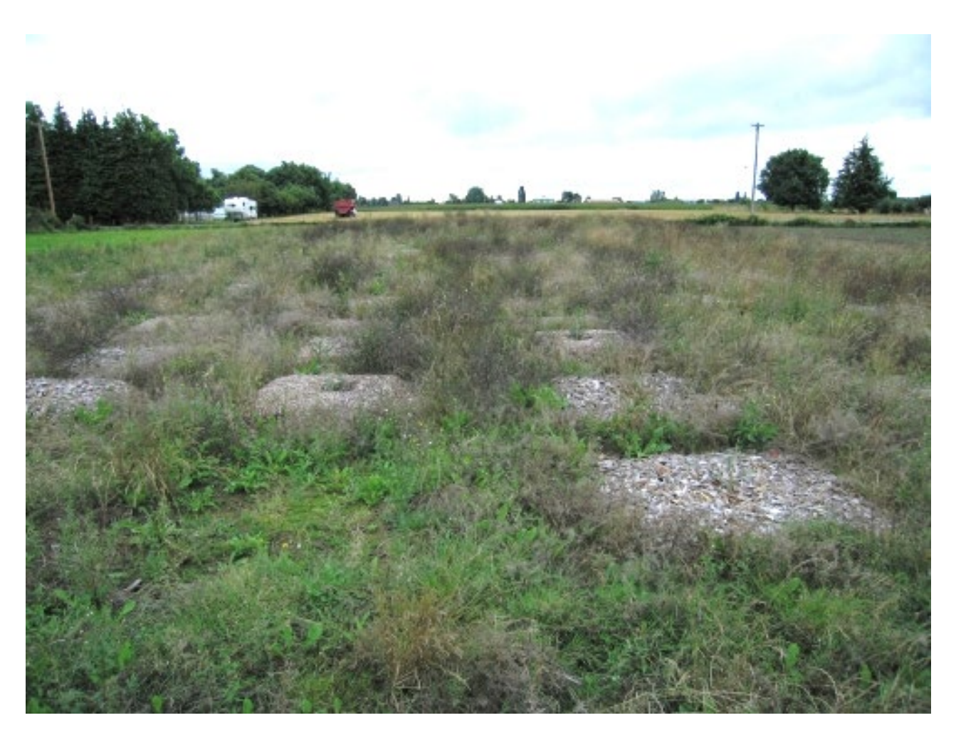
Figure 9. One year after mulch installation, weeds have covered the area except where wood chips are the deepest (8-12 inches). Photo courtesy of Eric Eulenberg.

Figure 8. Freshly installed wood chip mulches at different depths during field research. Photo courtesy of Eric Eulenberg.