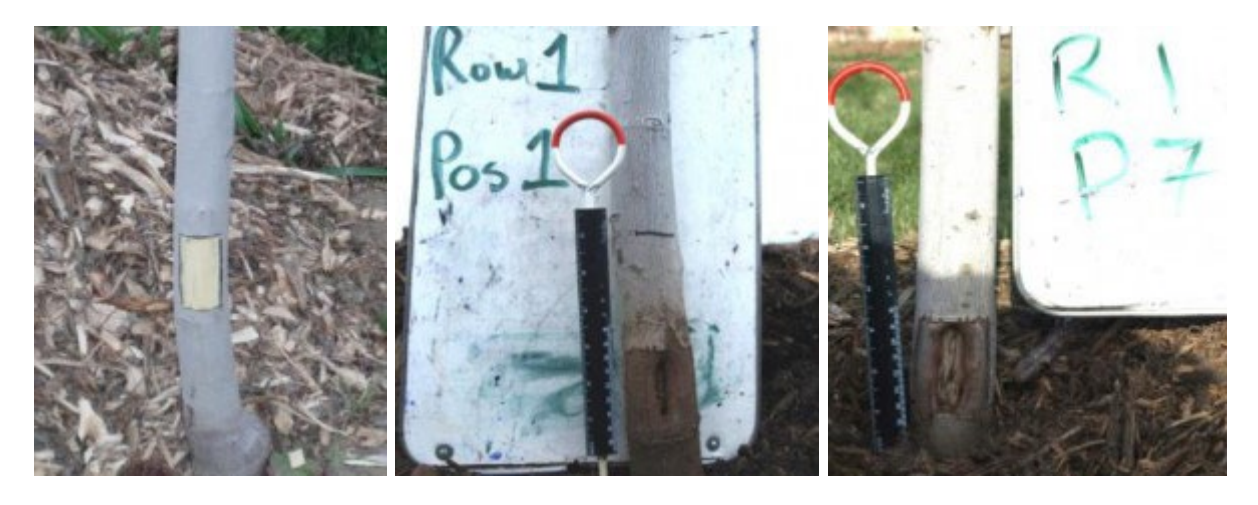
Figure 7. Wounded maple trees (left) were covered with AWC mulch (center) or left exposed (right). Wound closure was generally enhanced when covered with arborist wood chips.