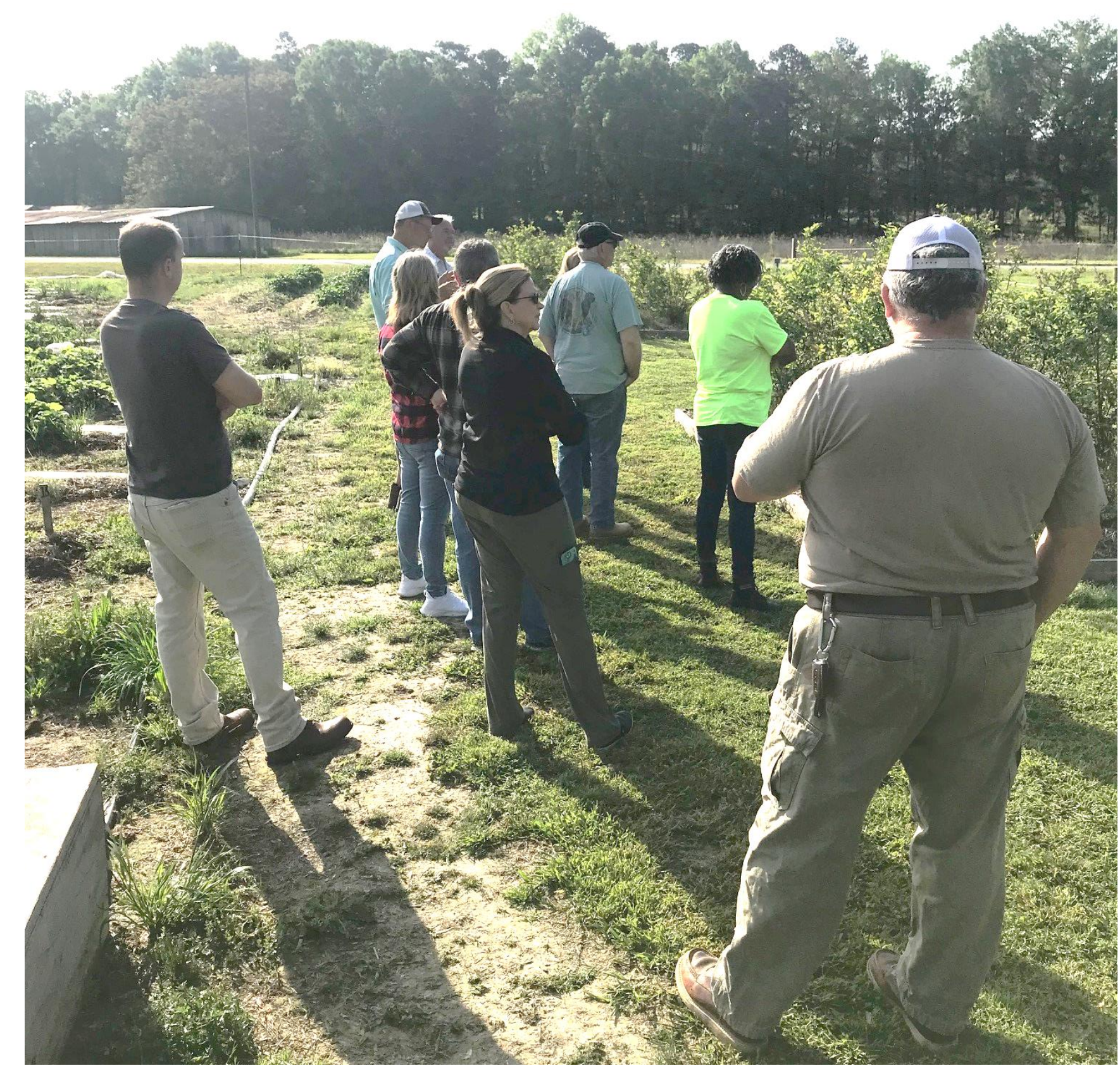
Participants in the 2022 Journeyman Farmer Certificate Program attend a tour at Double Branches Farm and Produce Market, a successful operation in Lincoln County.

85% of attendees indicated they were extremely likely to attend an Extension program or use Extension services in the future.