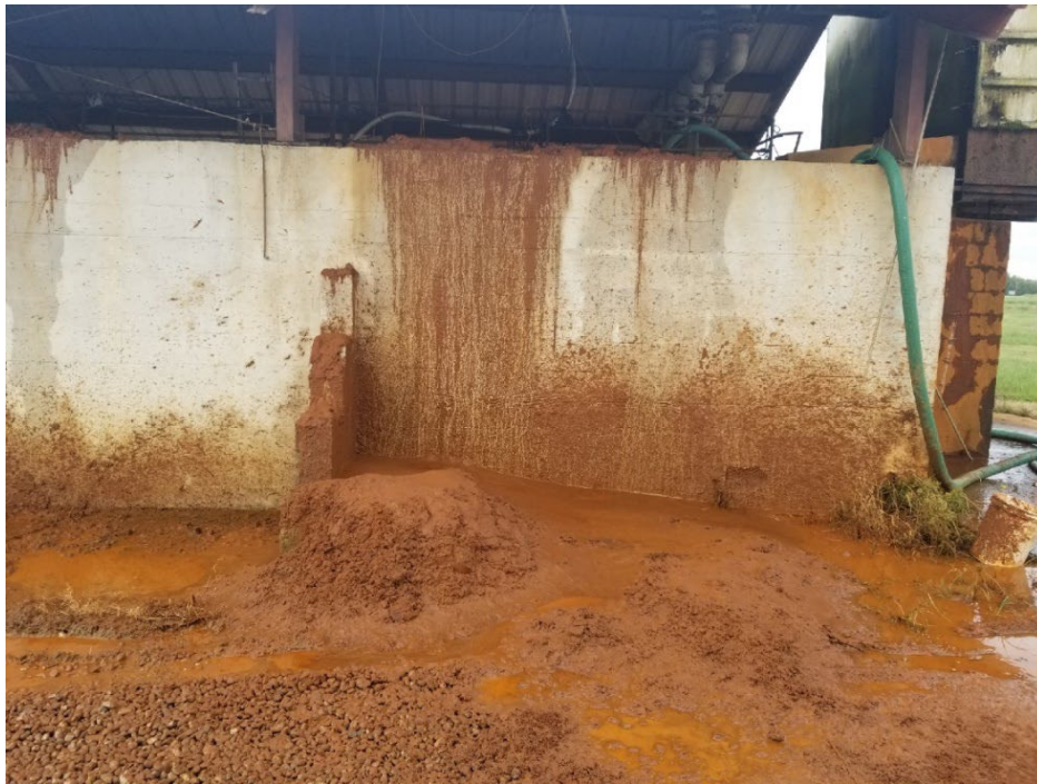
Figure 5. Extraction of sediment and iron compounds from a sedimentation tank on a commercial farm.

Allowing farmers to participate in the project led them to take ownership of the problem and implement corrective actions accordingly to their own needs. The responsiveness of producers evidenced their willingness to engage in a research project. The impact of the project was evidenced in upgrades that were performed in their facilities (cleaning and/or increasing sedimentation tanks, and degasification units) in five of the participant farms. Action of these farmers regarding spreading this information to other producers was not evaluated.