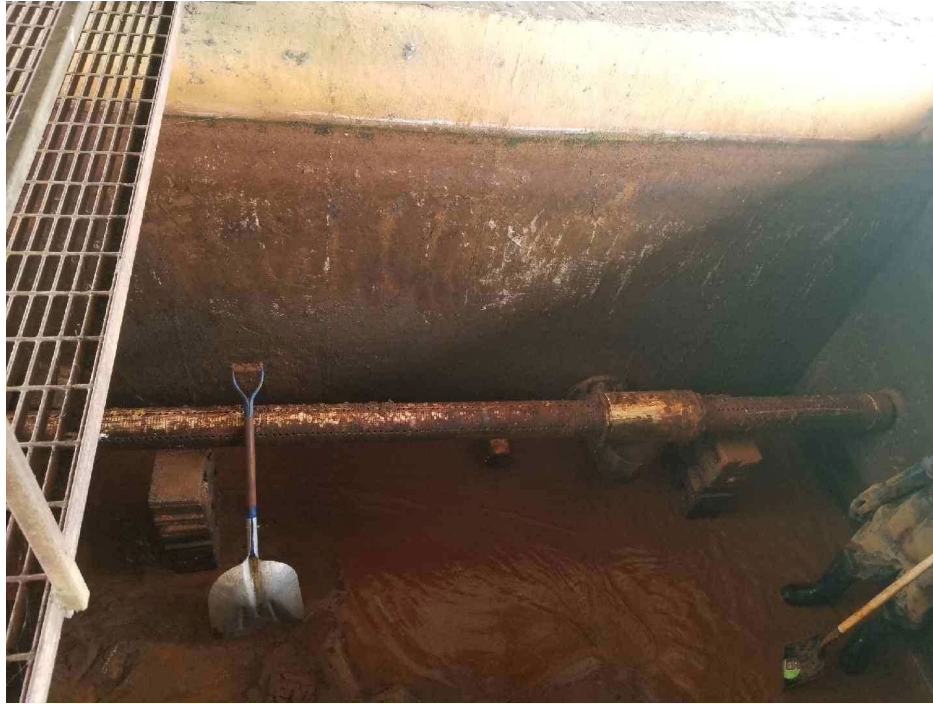
Figure 6. Residue from cleaning a sedimentation tank on a commercial farm.