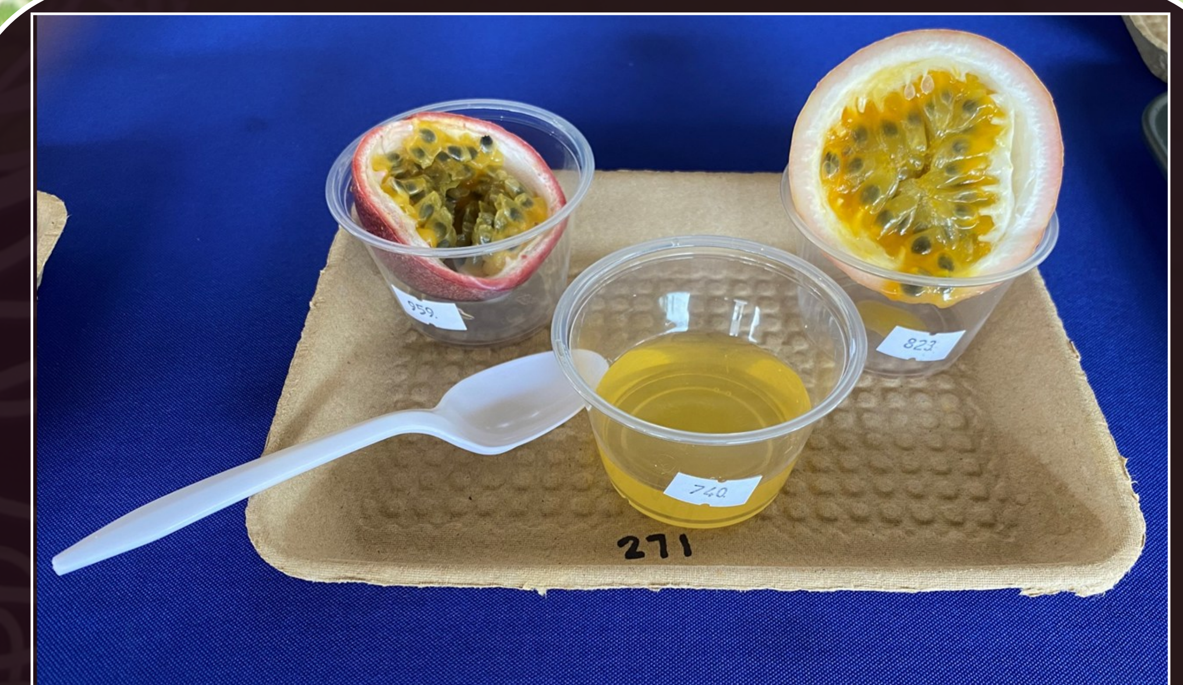
Sensory evaluation participants were provided with two varieties of passion fruit, which were evaluated based upon appearance, aroma, flavor, texture, and over all liking. Additionally, a passion fruit juice product as was also evaluated.