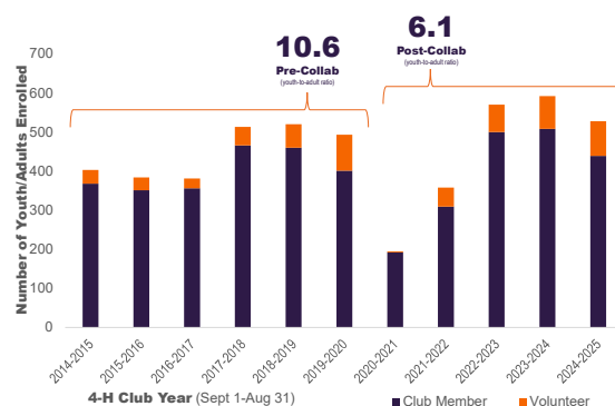
Figure 1. Enrollment of 4-H members and adult volunteers in 4HOnline associated with Shooting Sports and respective average of youth-to-adult ratios before (Pre-Collab) and after (Post-Collab) organizations joined.