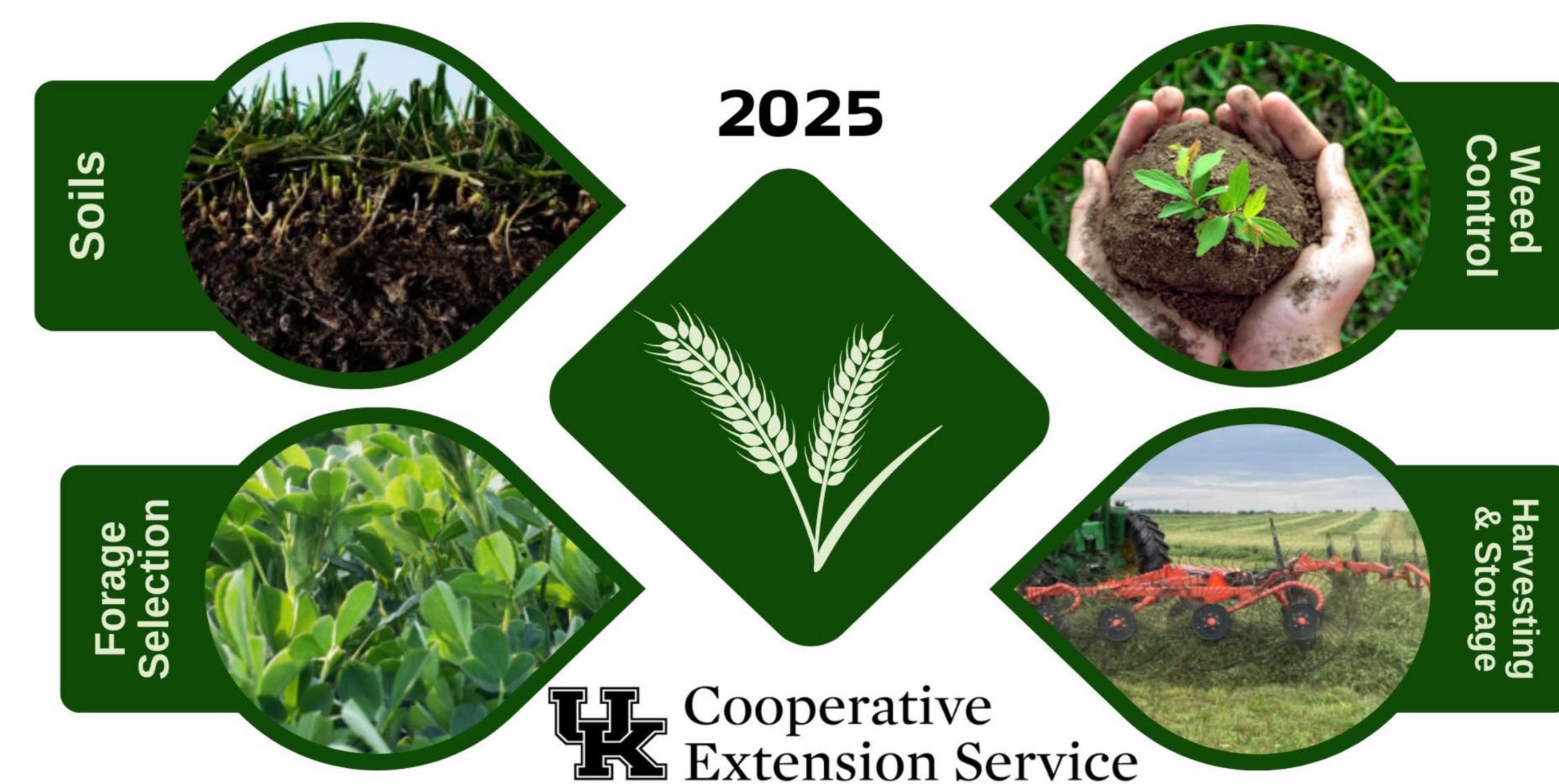
Figure A: Custom farm entrance sign given to each completing participant