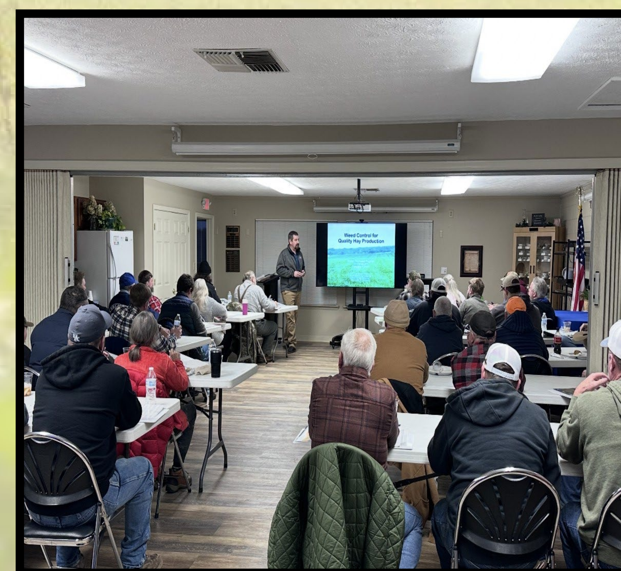
Figure B: Participants during the weed management session