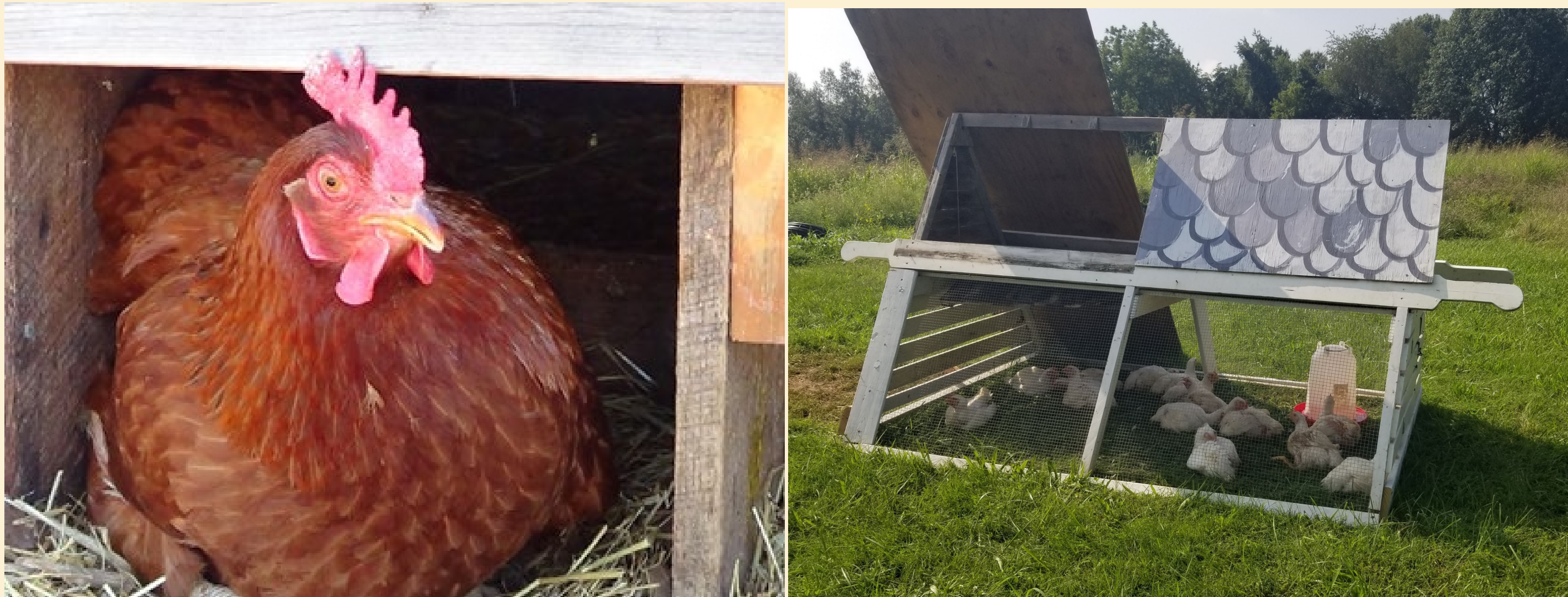
Poultry can be produced at a scale-appropriate for urban farms