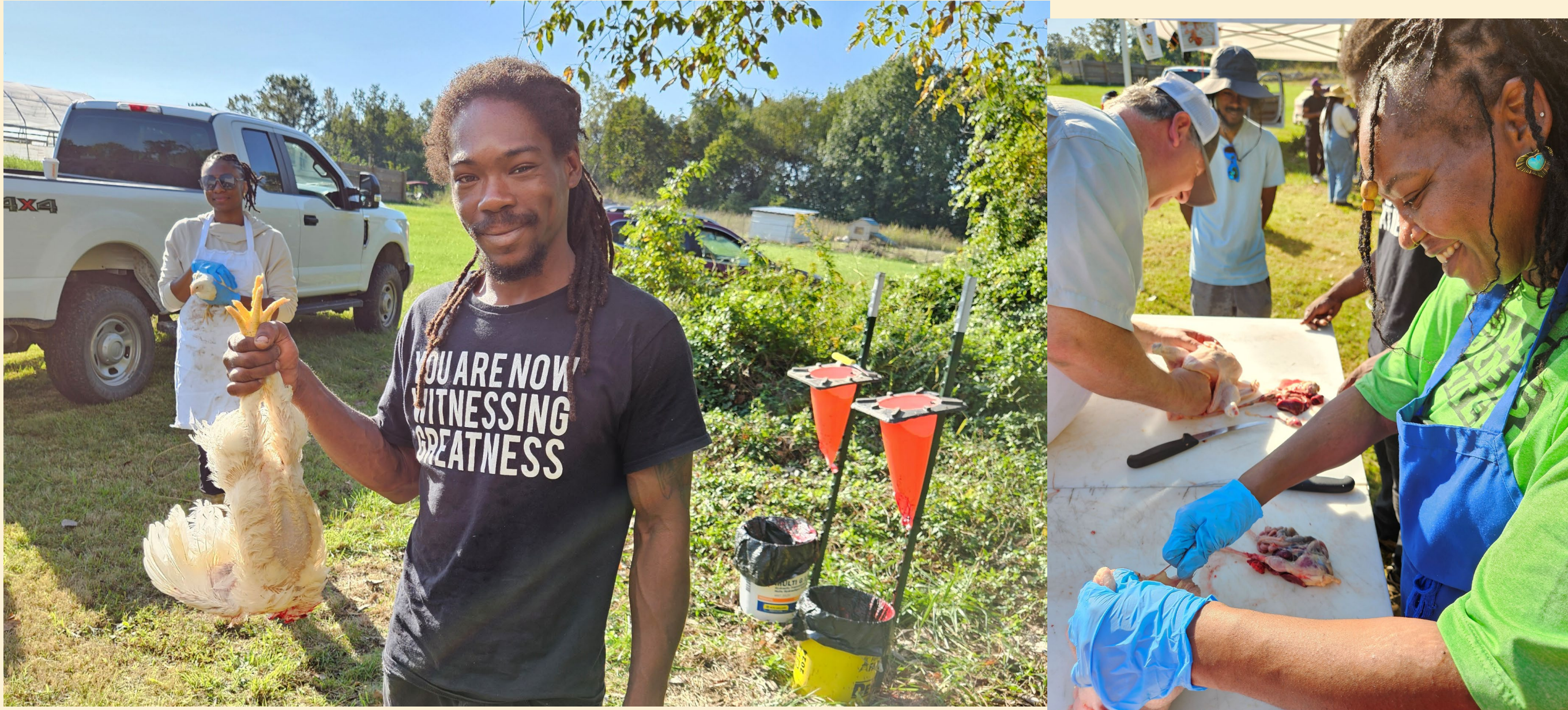
On-Farm poultry processing workshop participants learning by doing.