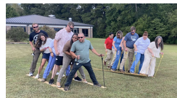
Team Building during Orientation Day