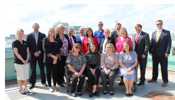
State Government Day in Montgomery