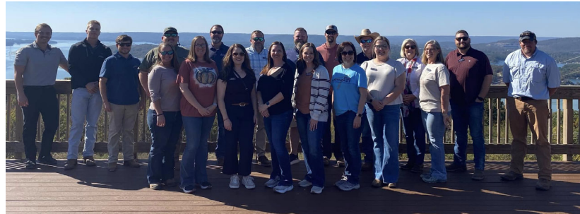
Leadership Days allow participants to network and learn about opportunities in Jackson County.