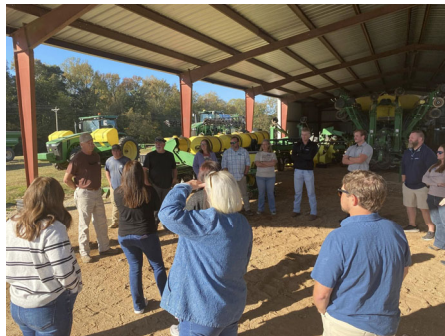
Agriculture and Natural Resources Day

Leadership Jackson County is a program led by Jackson County Alabama Extension. It is designed to develop and enhance community leadership and networking. Participants are provided with diverse experiences that will help them gain expanded knowledge of our county, develop relationships, and acquire leadership skills that would allow them to become more effective and active contributors in addressing our county's issues and needs. This is a program designed for men and women interested in the future of Jackson County.