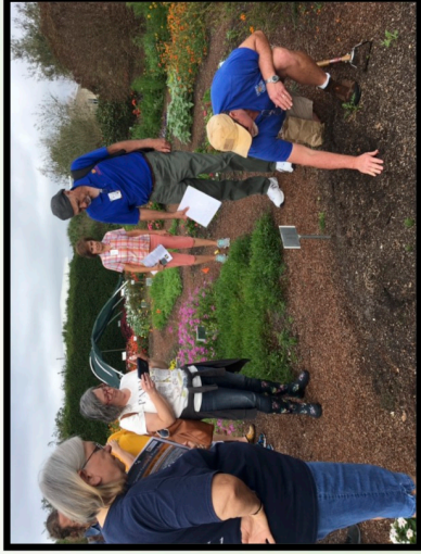
Participants learn how to plant seeds during the in-person Wildflower Gardening class.

Extension clients are now requesting educational programs in-person, as a live webinar, and on-demand webinar recordings.