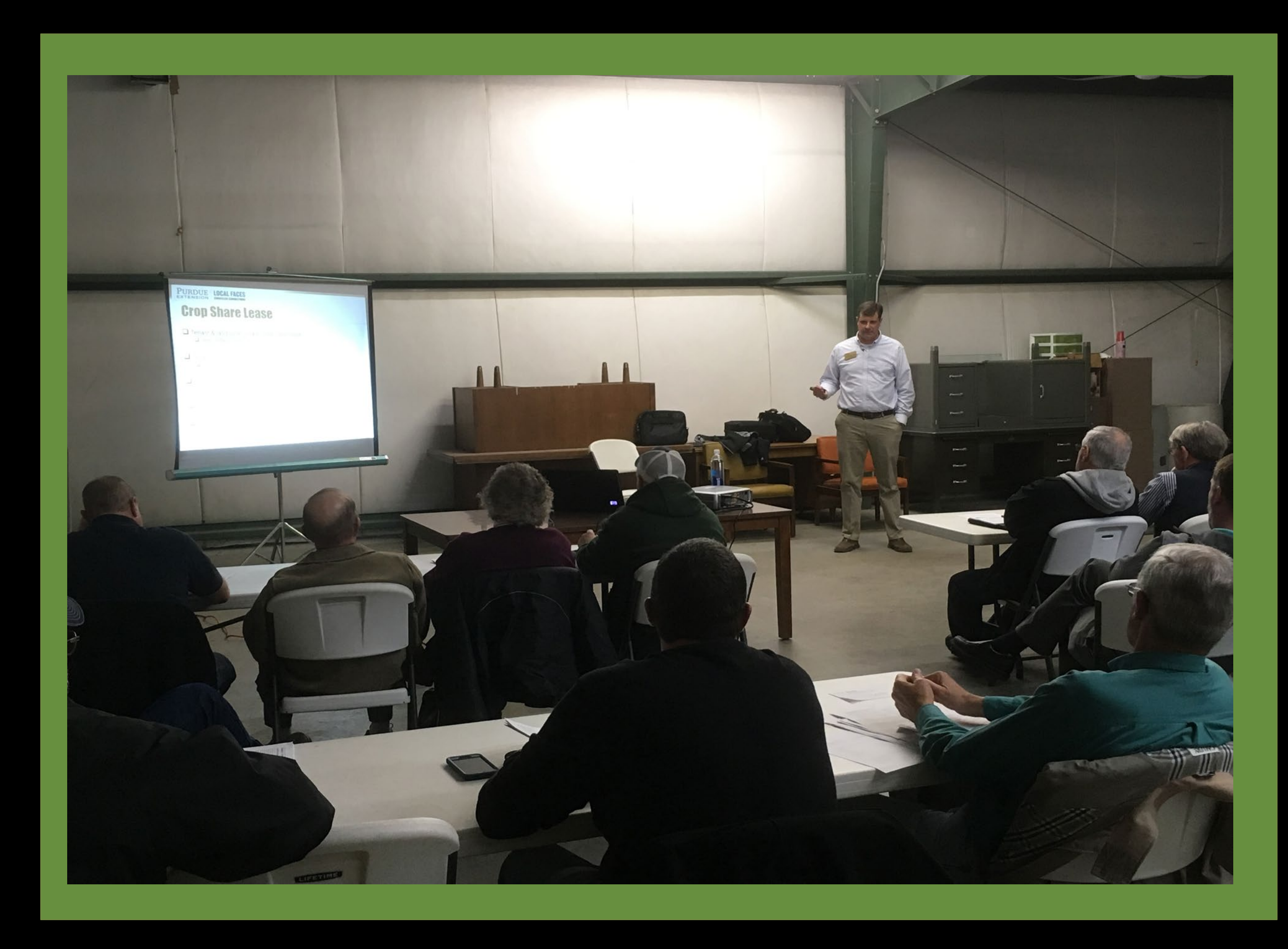
Thinking Like A CFO & Leading Your Business