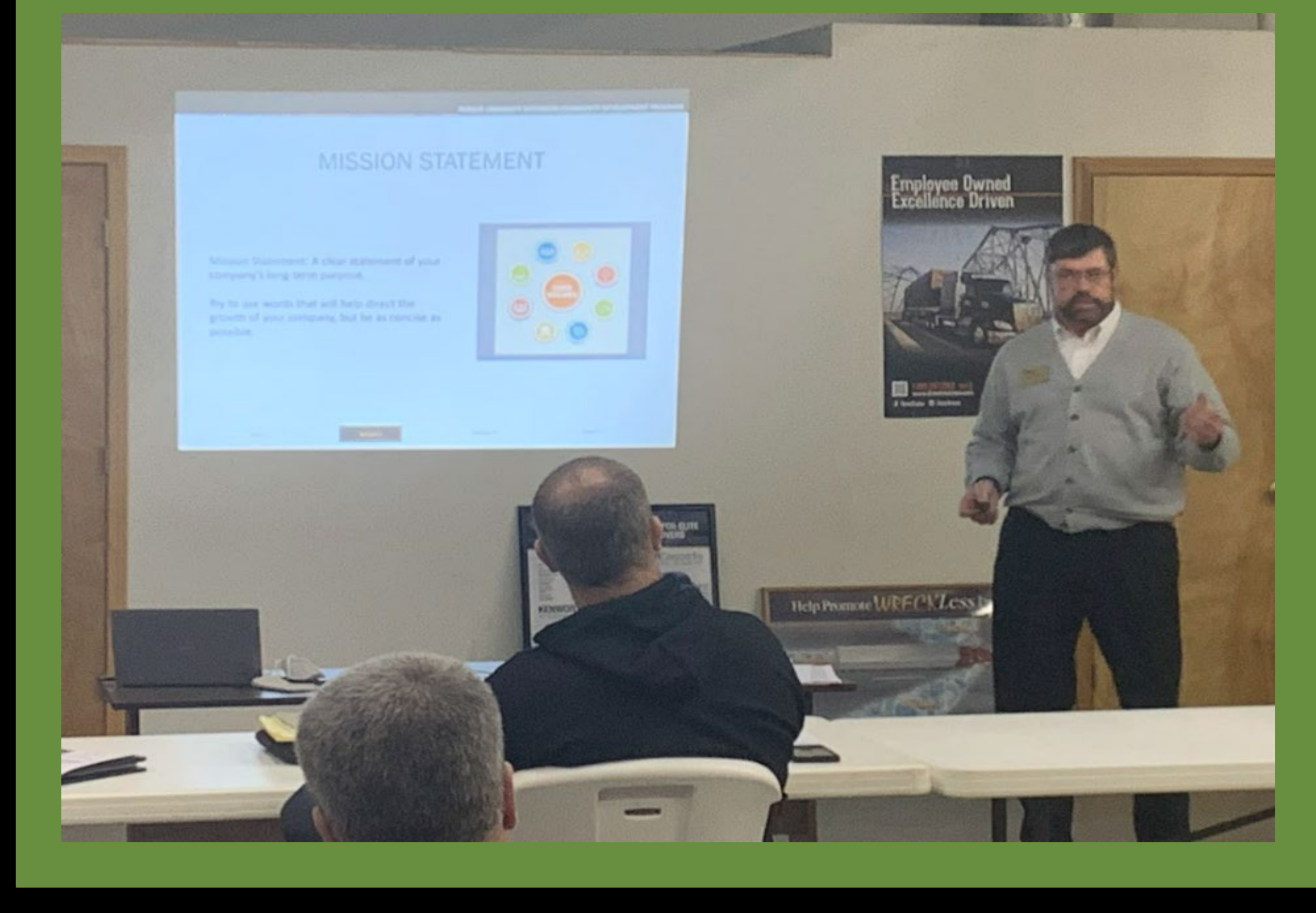
Farm Business Plan Basics