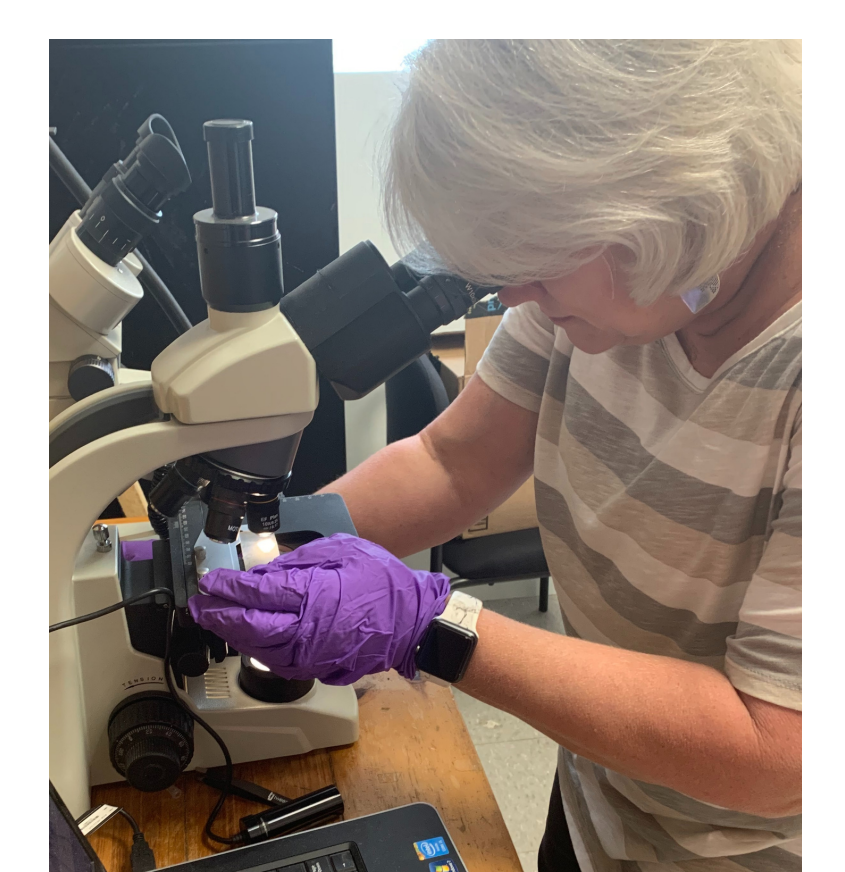
Local producer assessing parasite load