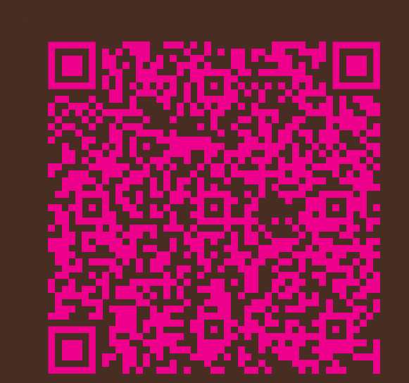
Scan for the Ranch Camp 2024 Application