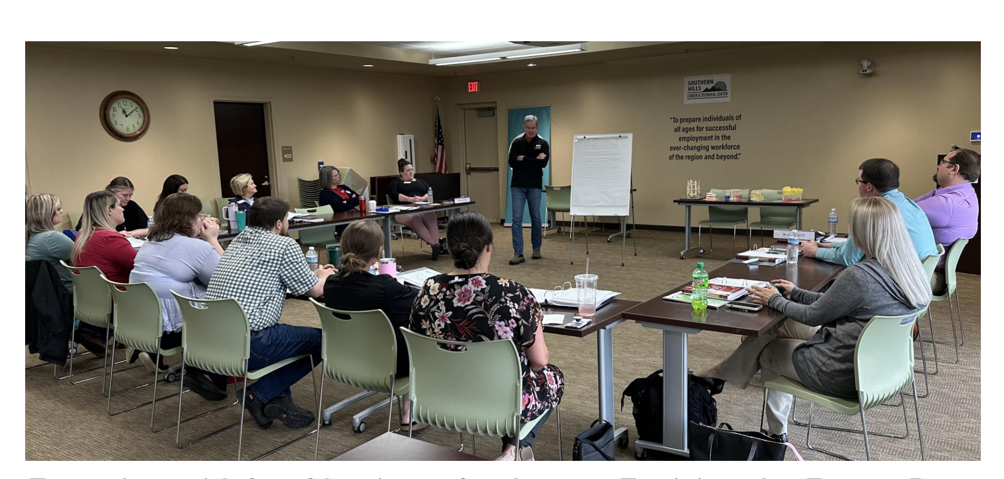
Engaging with local business leaders on Envision the Future Day

Recruitment Flyer – participants pay a fee to help recover costs