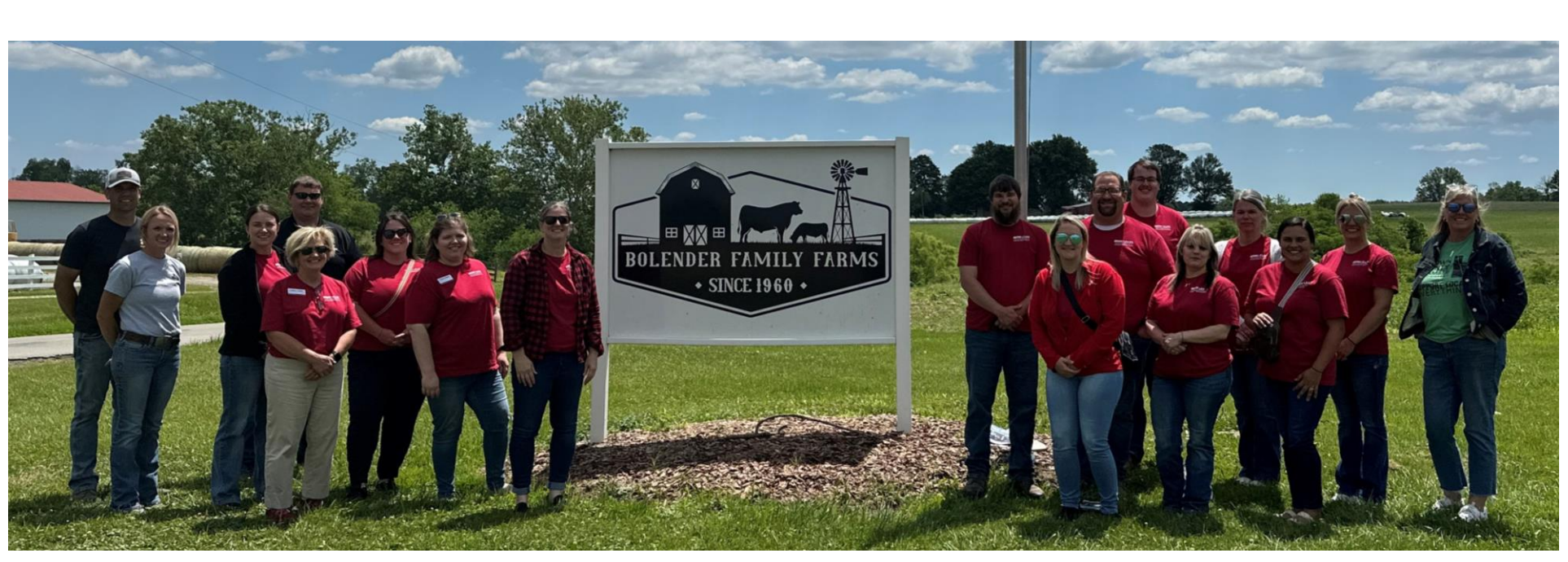
2024 Cohort on the Travel, Tourism & Agriculture Bus Tour