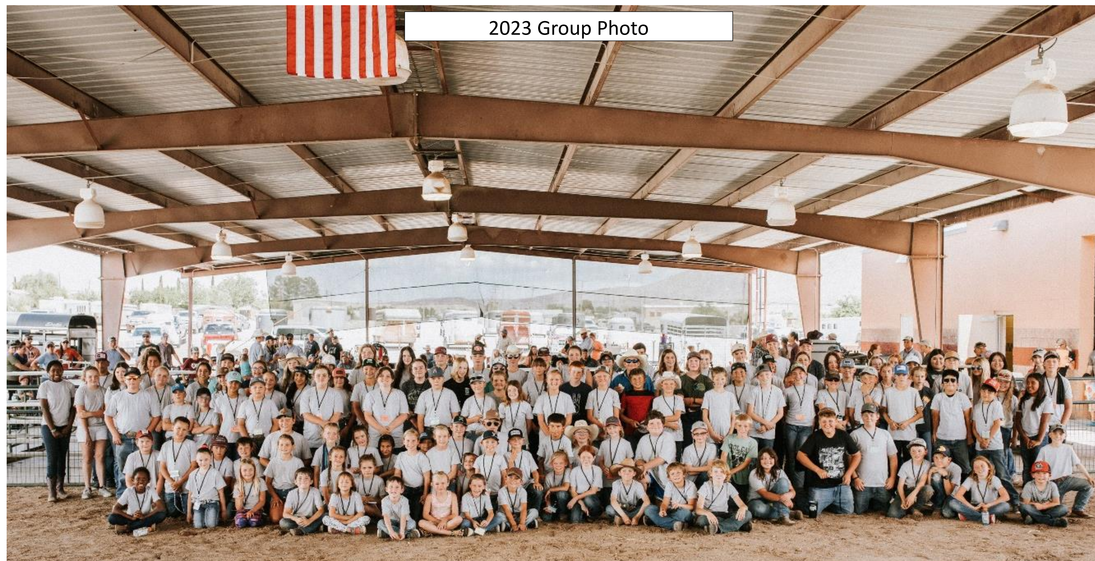
2023 Group Photo