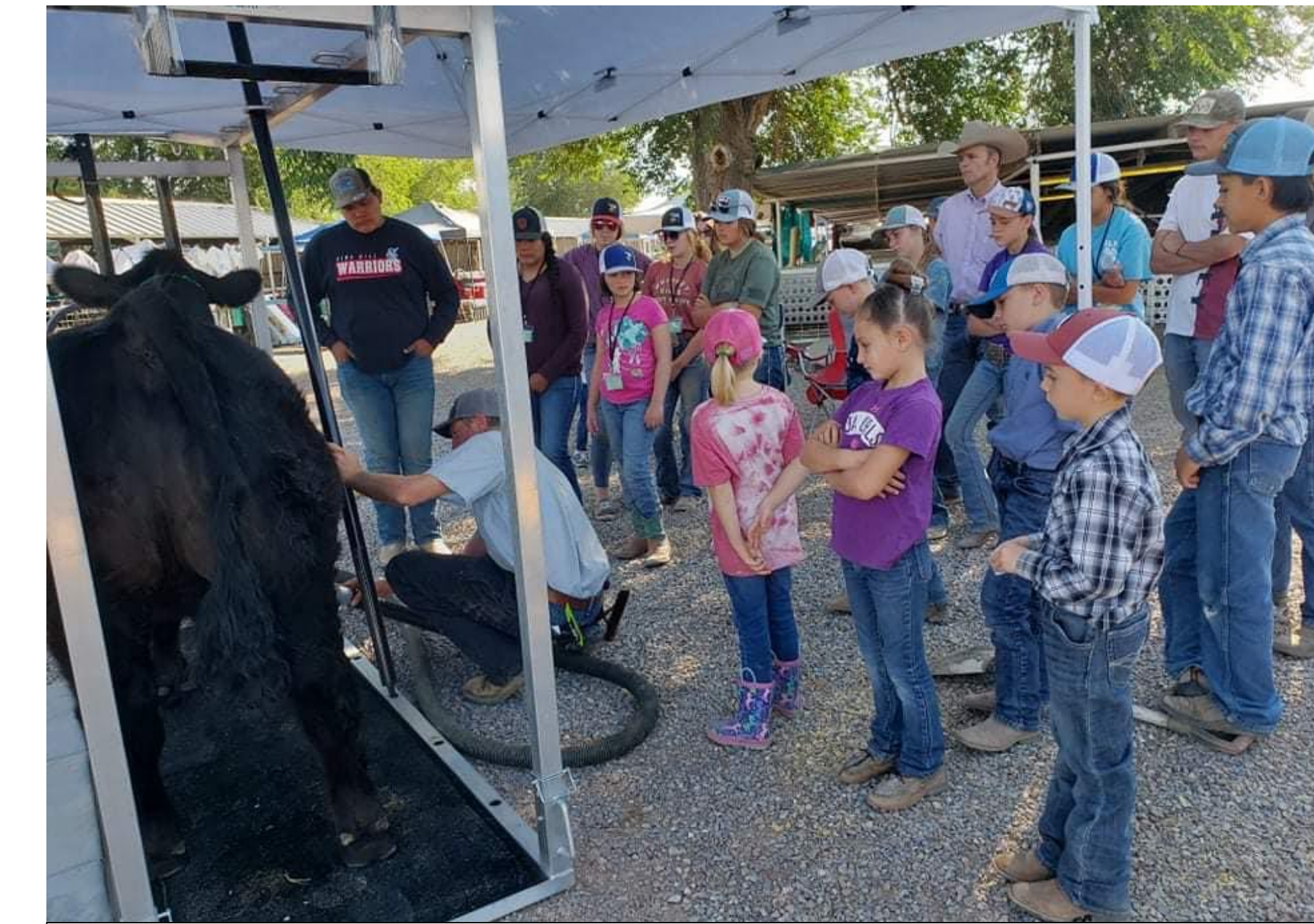
Hands on demonstrations and classroom instruction help balance out the long hot days and provide a variation of instructional methods.