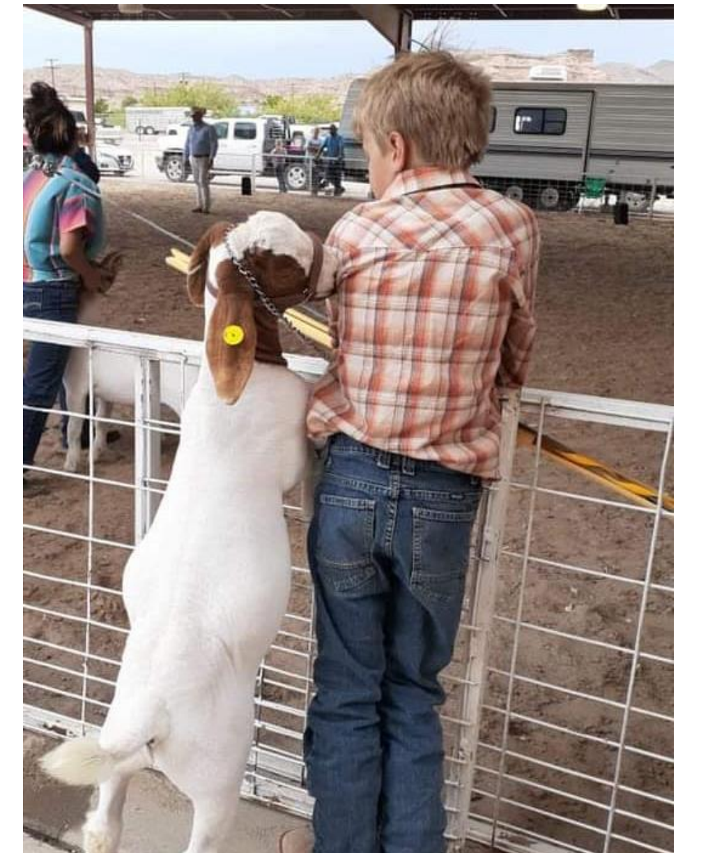
These kids really care for their animals!