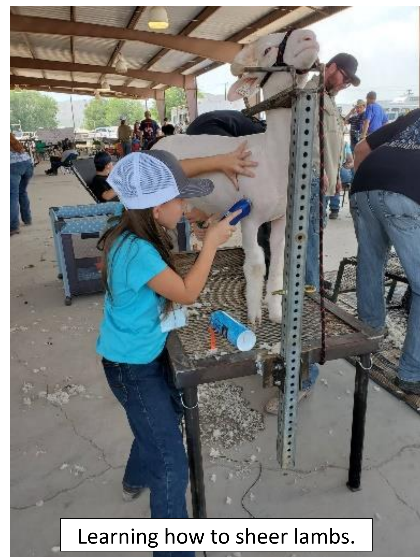
Learning how to shear lambs.

To provide youth an opportunity to gain knowledge in animal projects. The goal of the Southern Regional Livestock School is to provide an opportunity for youth and their parents to learn the ins and outs of livestock projects to better equip them for a successful project year. Livestock projects are goal oriented ventures providing youth self-discipline, self-responsibility, empathy, character and record keeping skills. Youth and parents will develop a better understanding of showmanship/presentation of their animal, training/exercise programs, day to day care, and basic feeding knowledge.