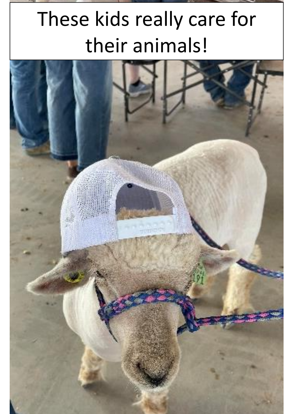
Showmanship practice three times a day.