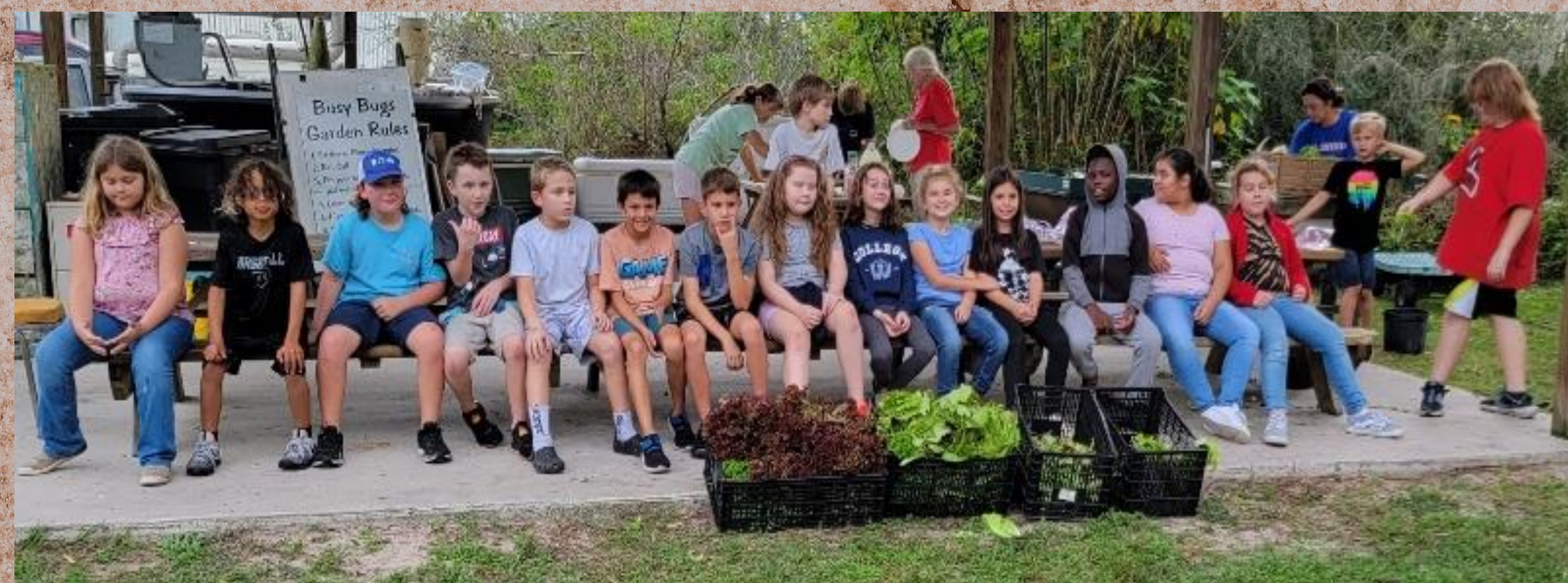
Youth Gardeners waiting for their last day in the garden celebration for 2023 showing harvested lettuce.