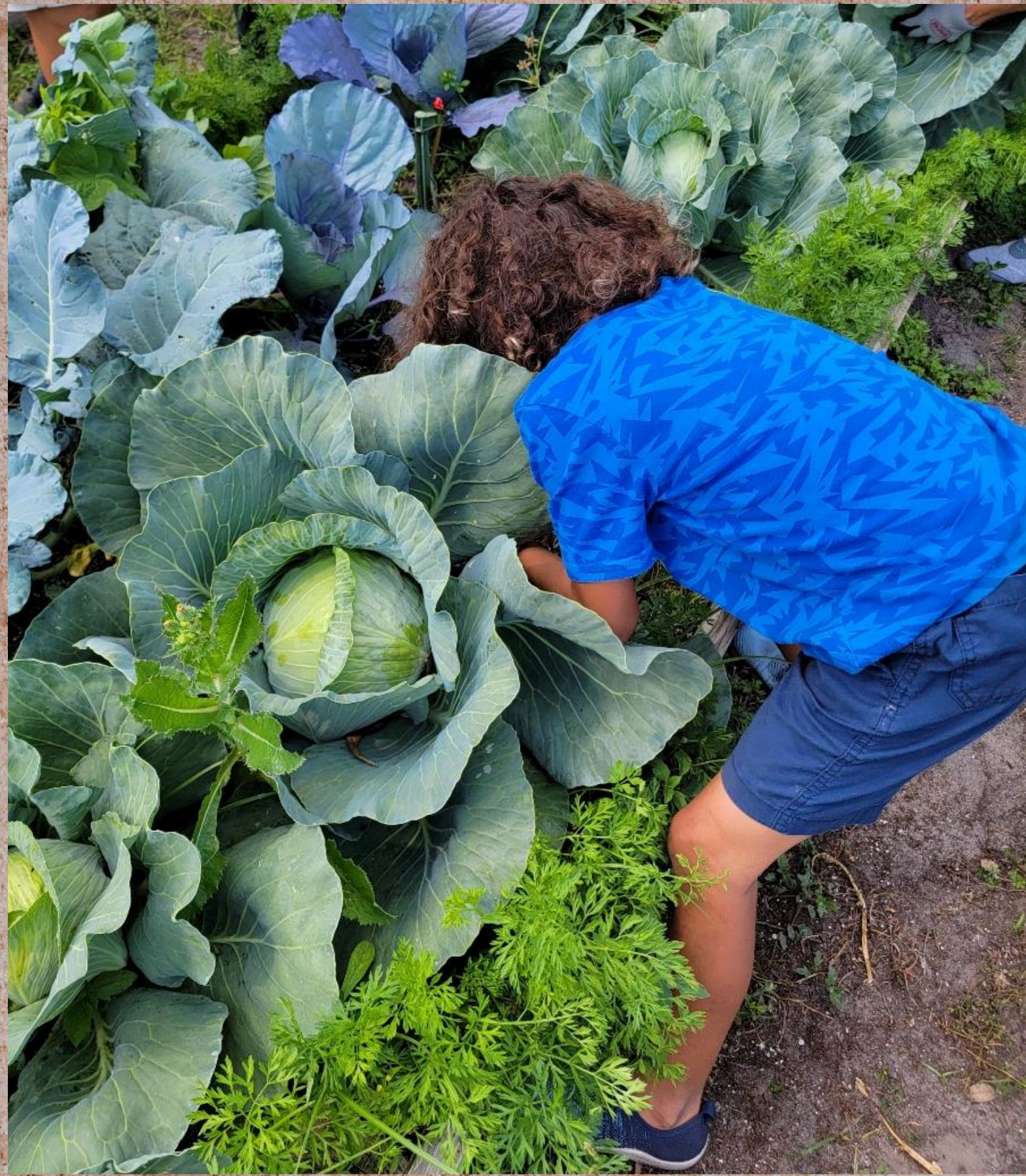
Gardener harvesting cabbage in the Youth Garden at the Sumter Youth Center.