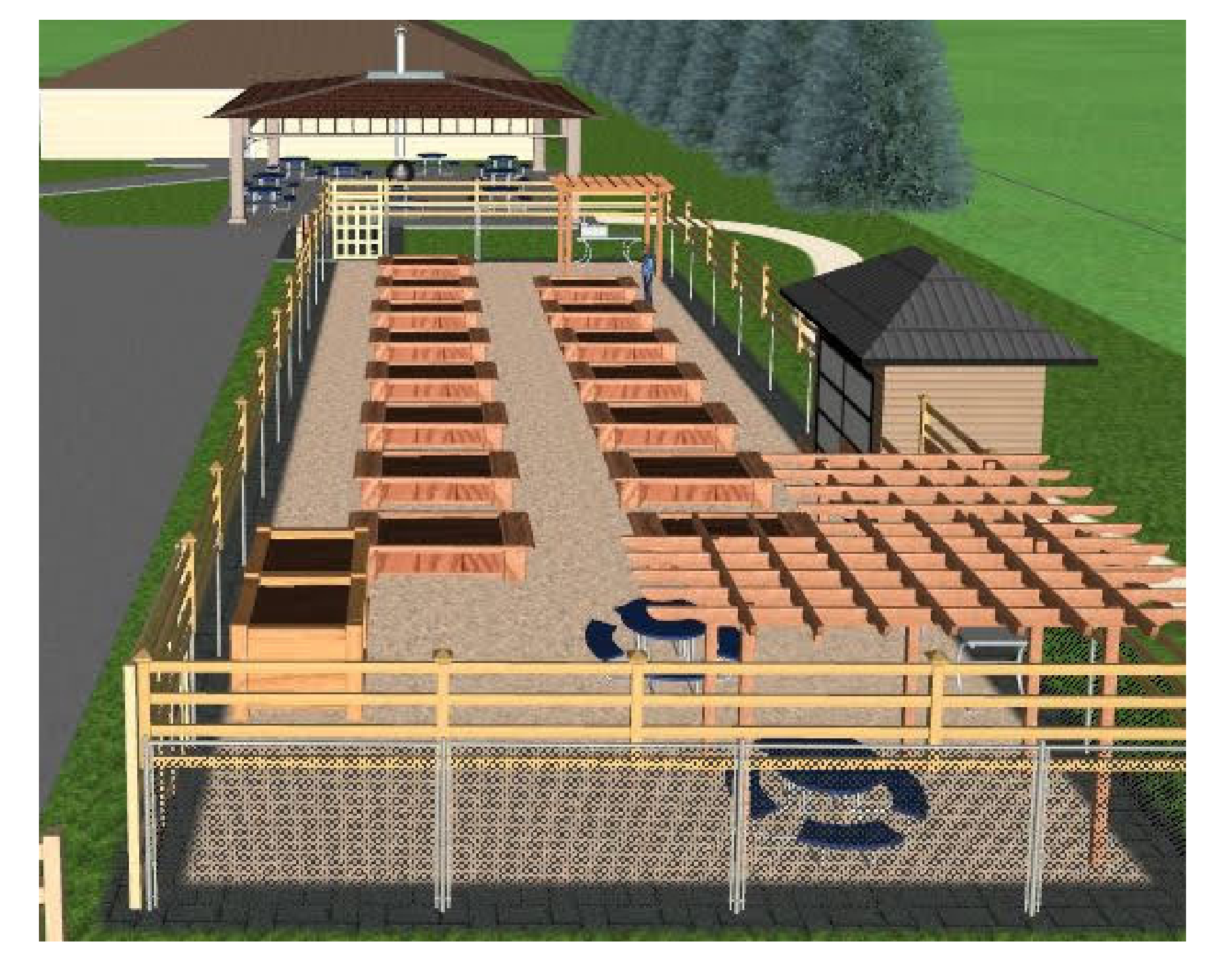
Design by: Green Belt Custom Landscape Design

66 The Winneshiek garden was one of 33 county Growing Together Iowa mini-grants, that collectively grew 114,793 pounds of fruits and vegetables that were donated to 115 food pantries and distribution sites serving almost 67,000 Iowans, <sup>99</sup> shared by Katie Sorrell a Policy, Systems and Environmental Change Coordinator.