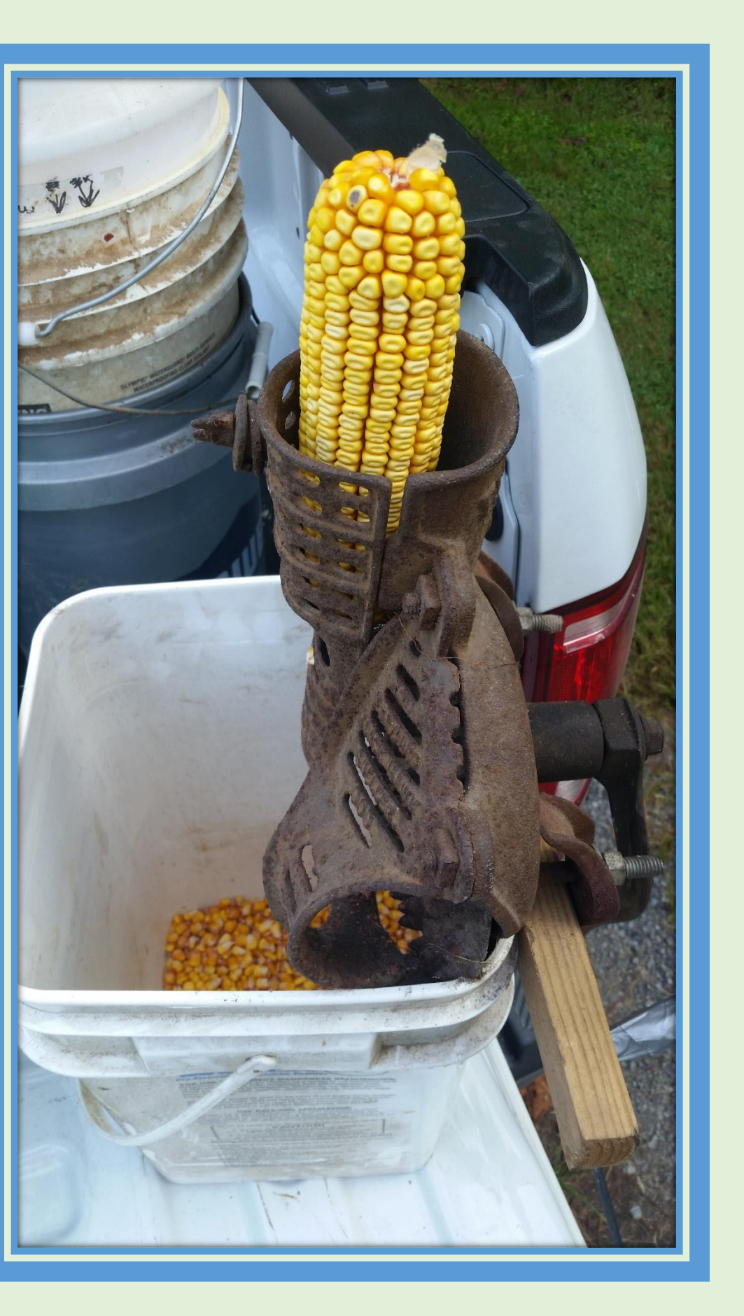
Figure 5: Corn from all red flags, → blue flags, and yellow flags were counted and weighed. Average weights per ear were calculated for each grouping.

← Figure 4: When corn reached maturity, ears were hand harvested, segregated by color and shelled with an old-time crank style single ear sheller.