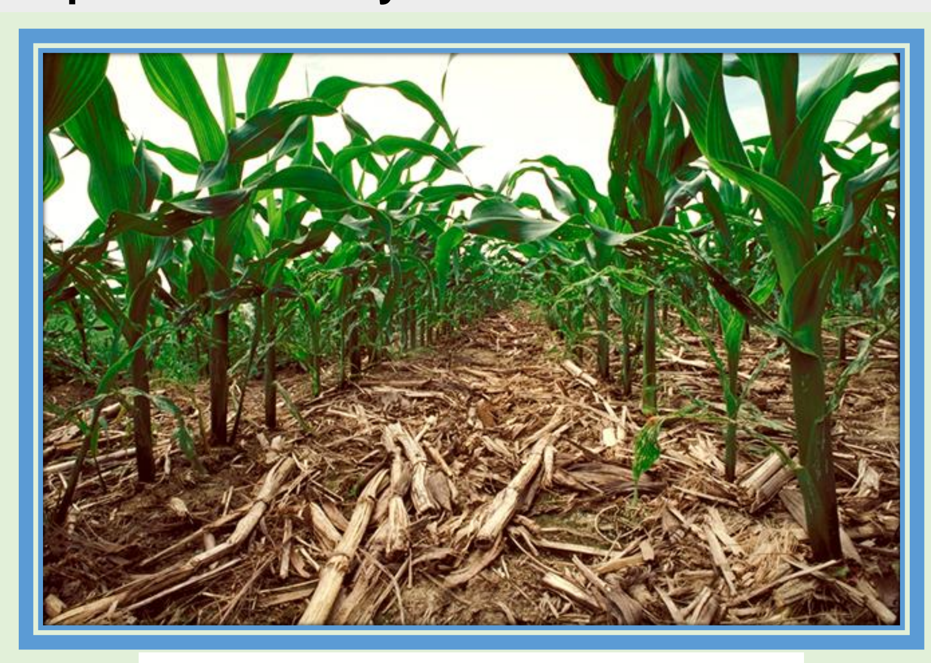
Figure 1: Uniform Corn Emergence

Seedling vigor and days to maturity start when seeds are placed in soil capable of inducing germination. From there it is a foot race for plants to utilize available nutrients, sunlight, and moisture in fields that will be harvested collectively. This evaluation asked the question, will seeds that germinate sooner produce plants that will yield more?