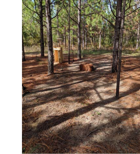
Figure 3 . Prior to the workshop on November 14, Ryan Bean built a pine straw baler box. The day before the workshop, Ryan and TJ Savereno prepared the raking demonstration area.