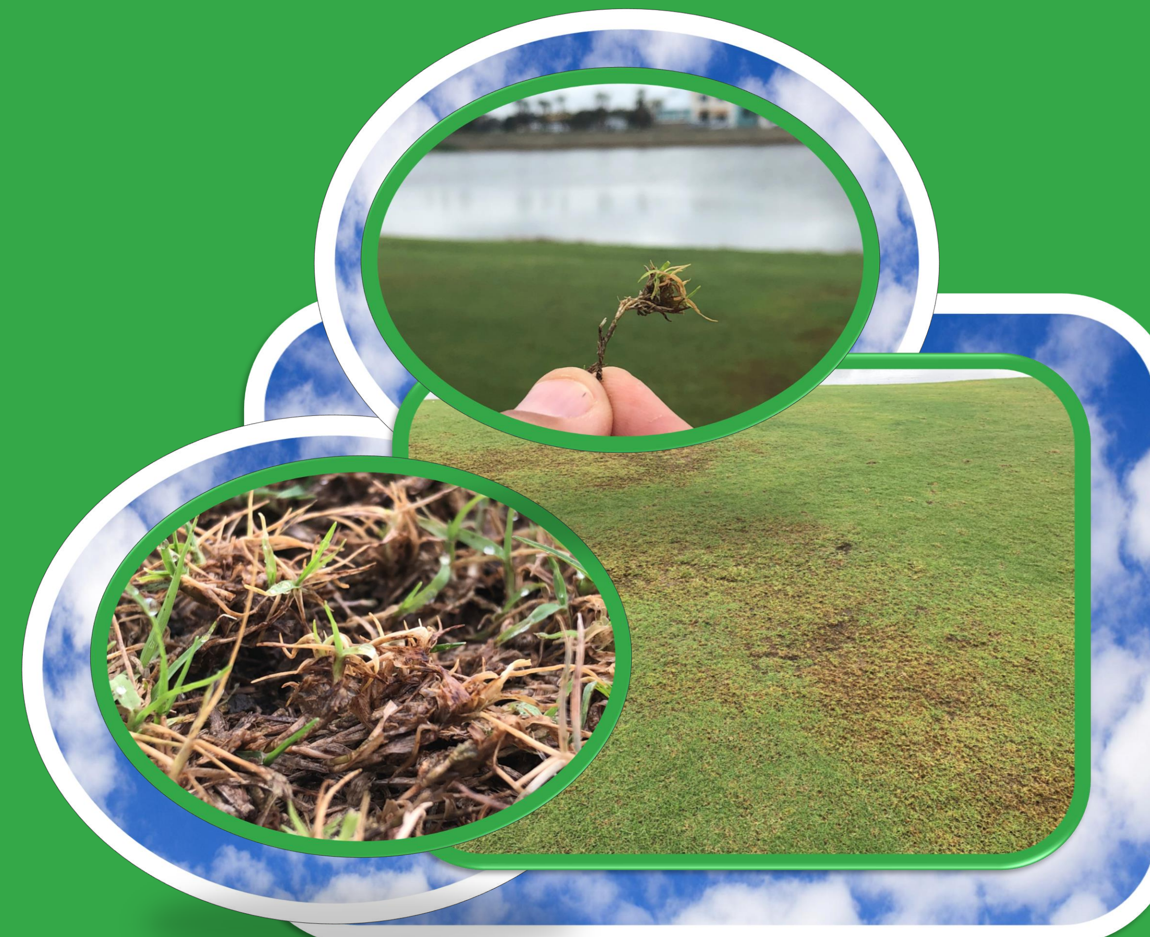
Figure 1. Damage caused by the bermudagrass mite, Eriophyes cynodontensis . The mite is a serious pest of bermudagrass ( Cynodon dactylon ) in athletic fields and golf courses. A pest management workshop was held that covered bermudagrass mite management. #UFBugs

The objective of this program is to equip Brevard County's golf and sports turf management professionals with information and the latest technologies to remain competitive in the market, as well as demonstrate the stewardship that can be achieved with an integrated and holistic management approach.