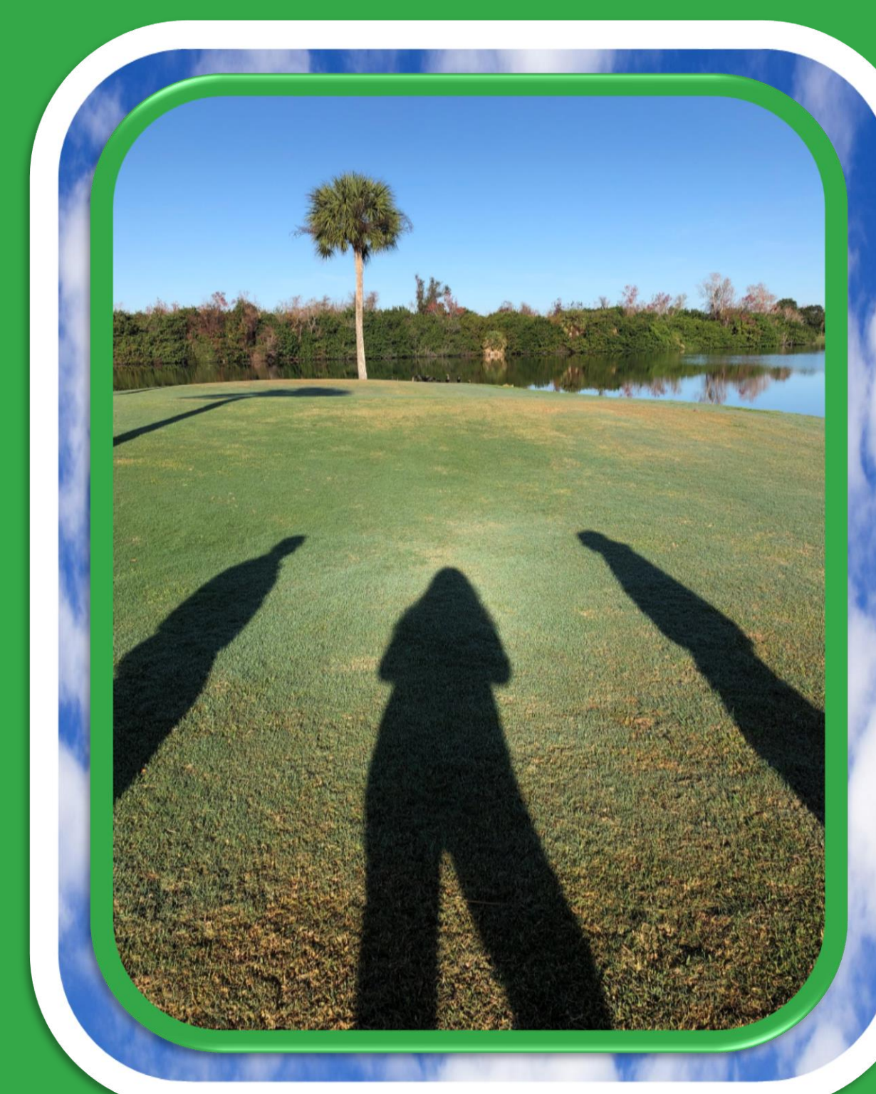
Figure 3. Sixty-one site visits were performed in 2019 to support this program.