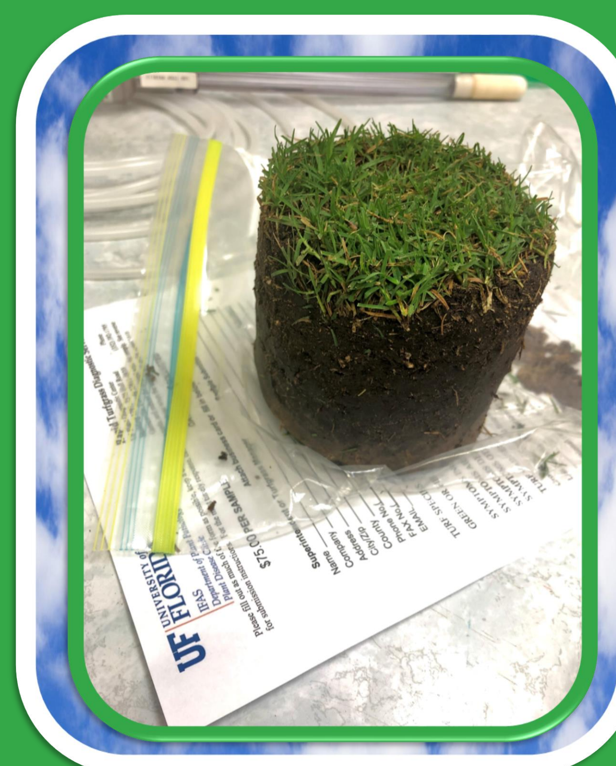
Figure 2. Attendees of one workshop learned how to send proper samples to the UF/IFAS Rapid Turfgrass Diagnostic Lab.