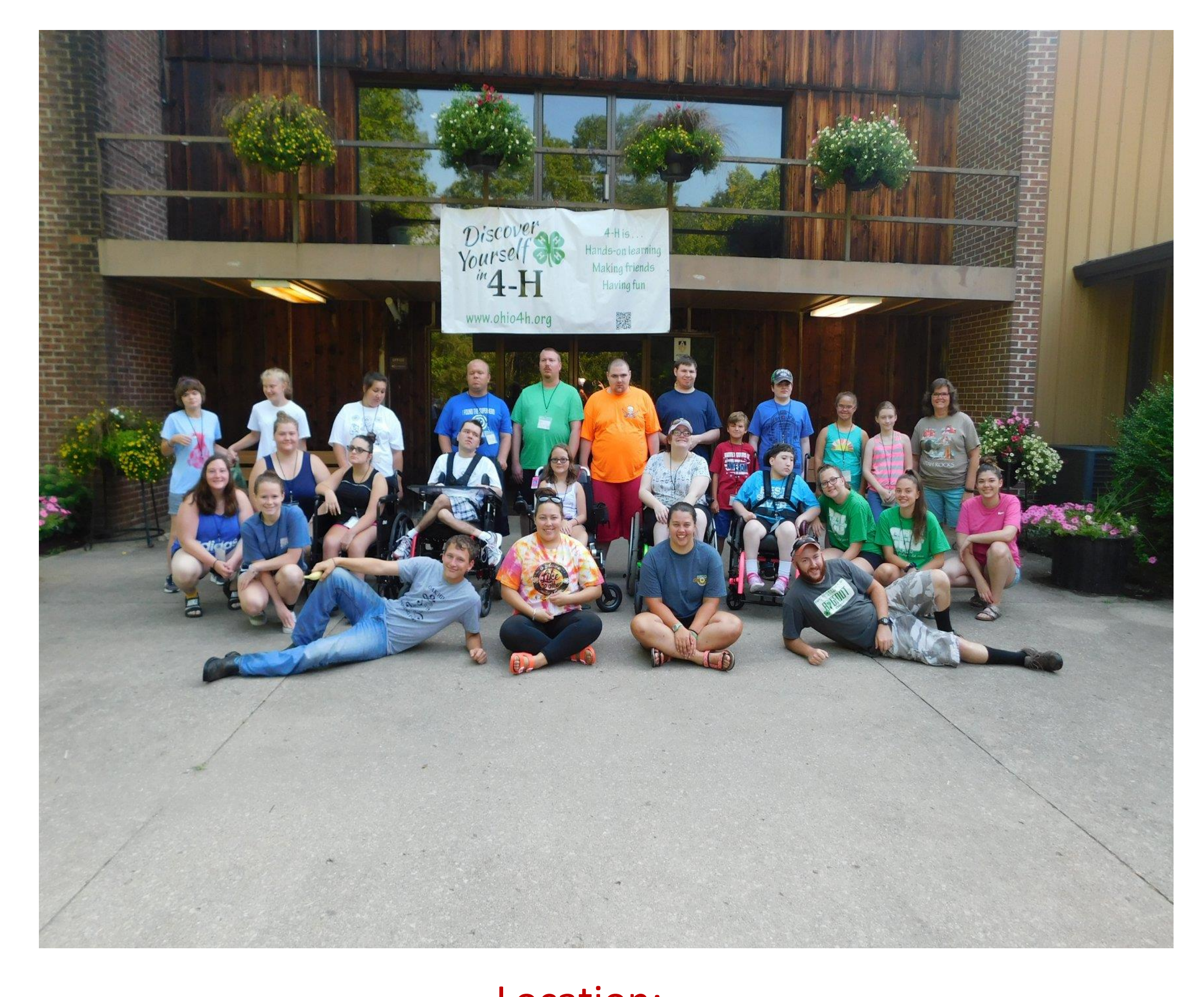
Location: Canter's Cave 4-H Camp 1362 Caves Road Jackson, OH https://4hcanterscave.osu.edu/