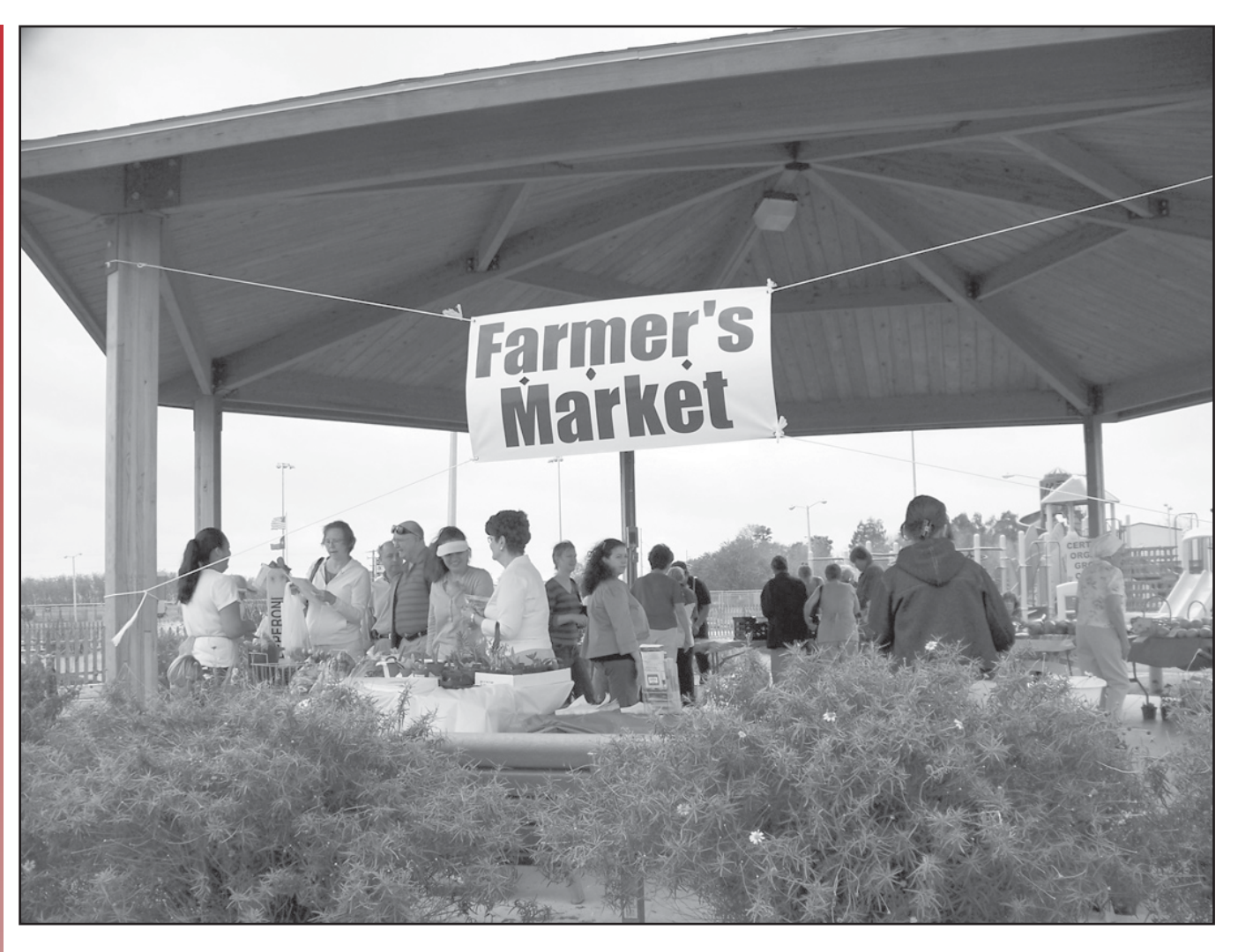
The Grow'n Growers of San Juan, Texas, sell their organic produce to eager customers just north of the Mexican border. The women credit the program with helping them fight depression as well as poverty.