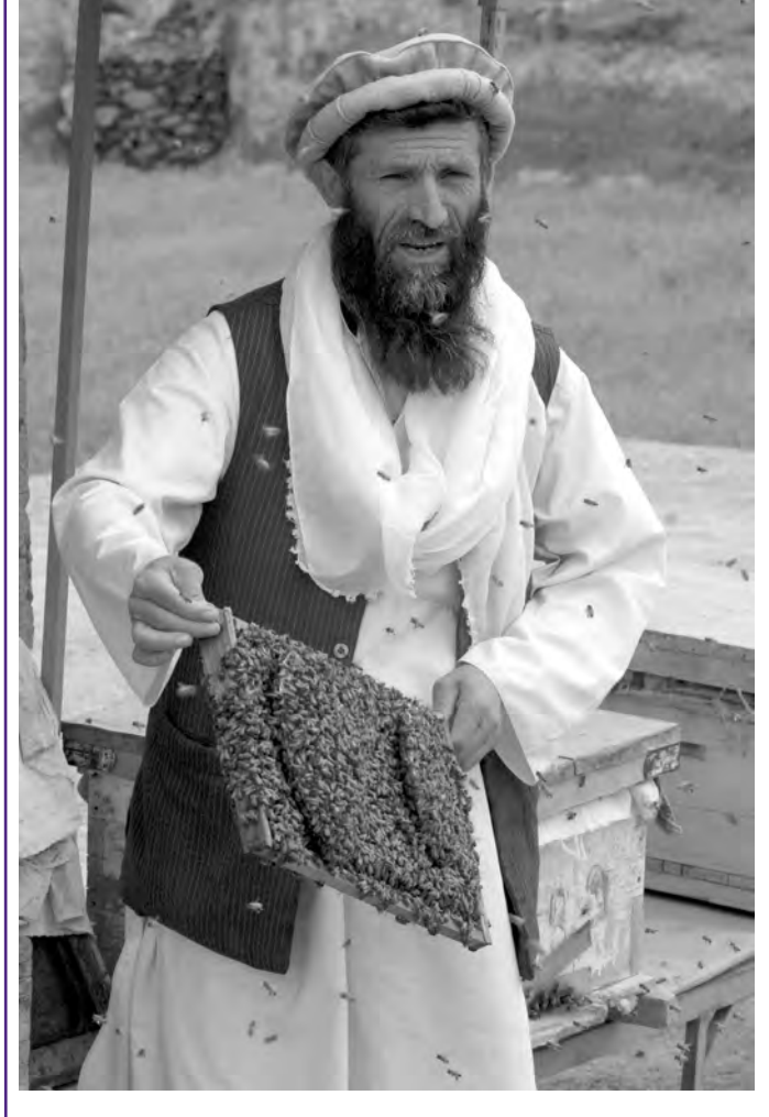
For more information about opportunities with USDA in Afghanistan, visit <u>http://www.fas.usda.gov/country/</u><u>Afghanistan/us-afghanistan.asp</u>.

"I would go again in a heartbeat," he said. "I could not create another opportunity for service and learning to compare with the deployment."