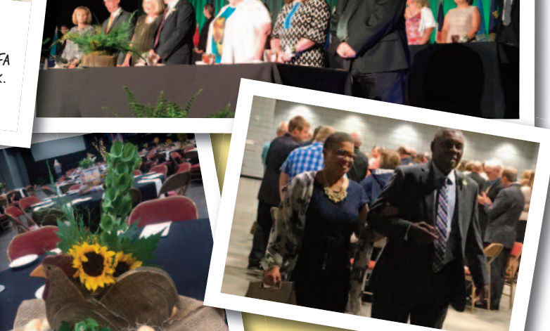
Table setting at Farewell Banquet

Above, scenes from the DSA banquet.