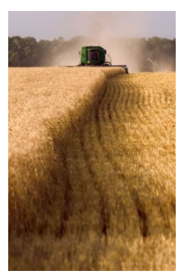
Photo from the 2014 South Dakota Department of Agriculture "the common thread"