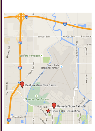
Click for larger map